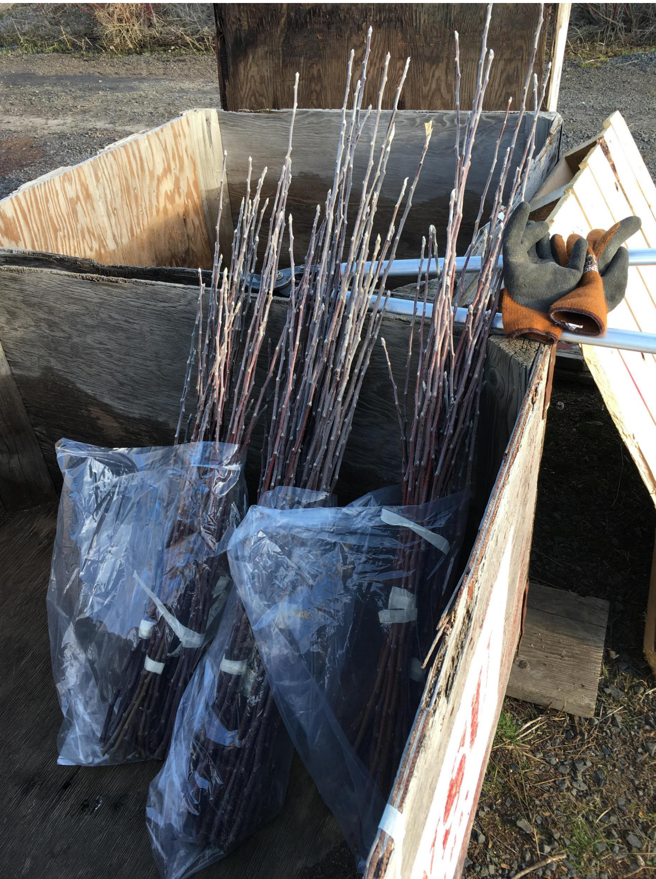
These are some of the scion wood cuttings that were collected from one of the largest variety block at Tukey Orchard.