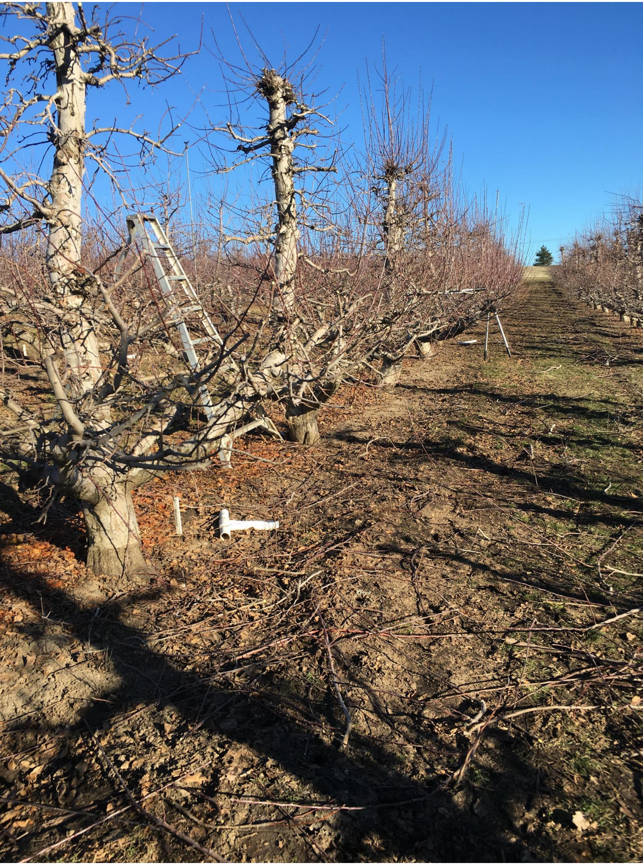
Here, we worked our way down a row of Golden Delicious. This image shows how vigorous this apple variety gets during the growing season.