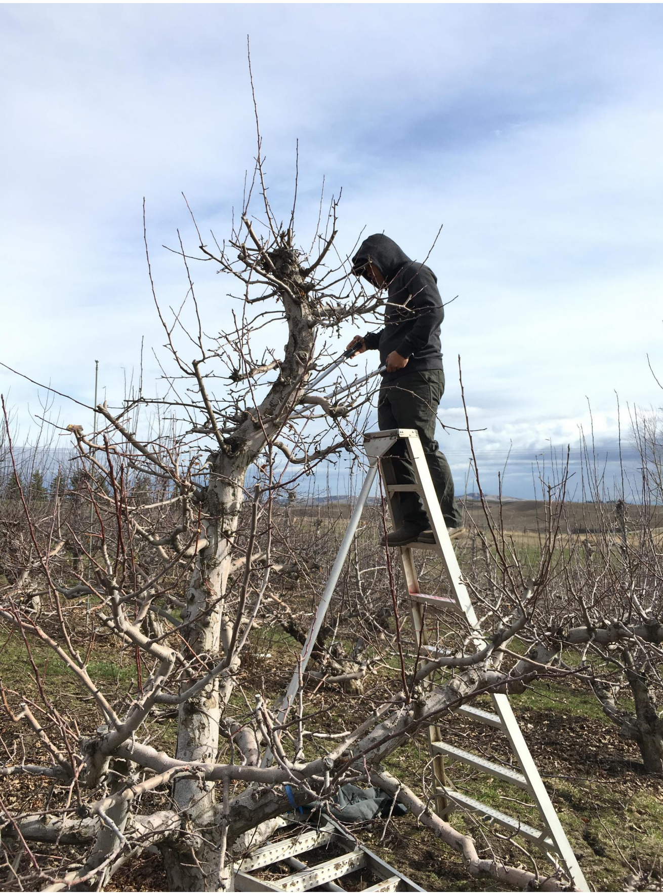
Pruning is an agricultural practice that is implemented to remove wood that may harbor diseases and pests. Pruning also improves crop yield and fruit quality.

Some of the main duties that I was assigned during my internship at Tukey Orchard include pruning various apples cultivars, collecting hundreds apple scion wood cuttings from various apple cultivars, sorting good fruit from the bad fruit prior to the fruit sale, and removing fruit from the storage room and displaying it on the tables for Tukey Orchard’s weekly fruit sale. I was also exposed to agricultural practices such as controlling pests in tree-fruit production systems, understanding how Tukey Orchard is irrigated, and learning about the importance of trellis systems on fruit trees.