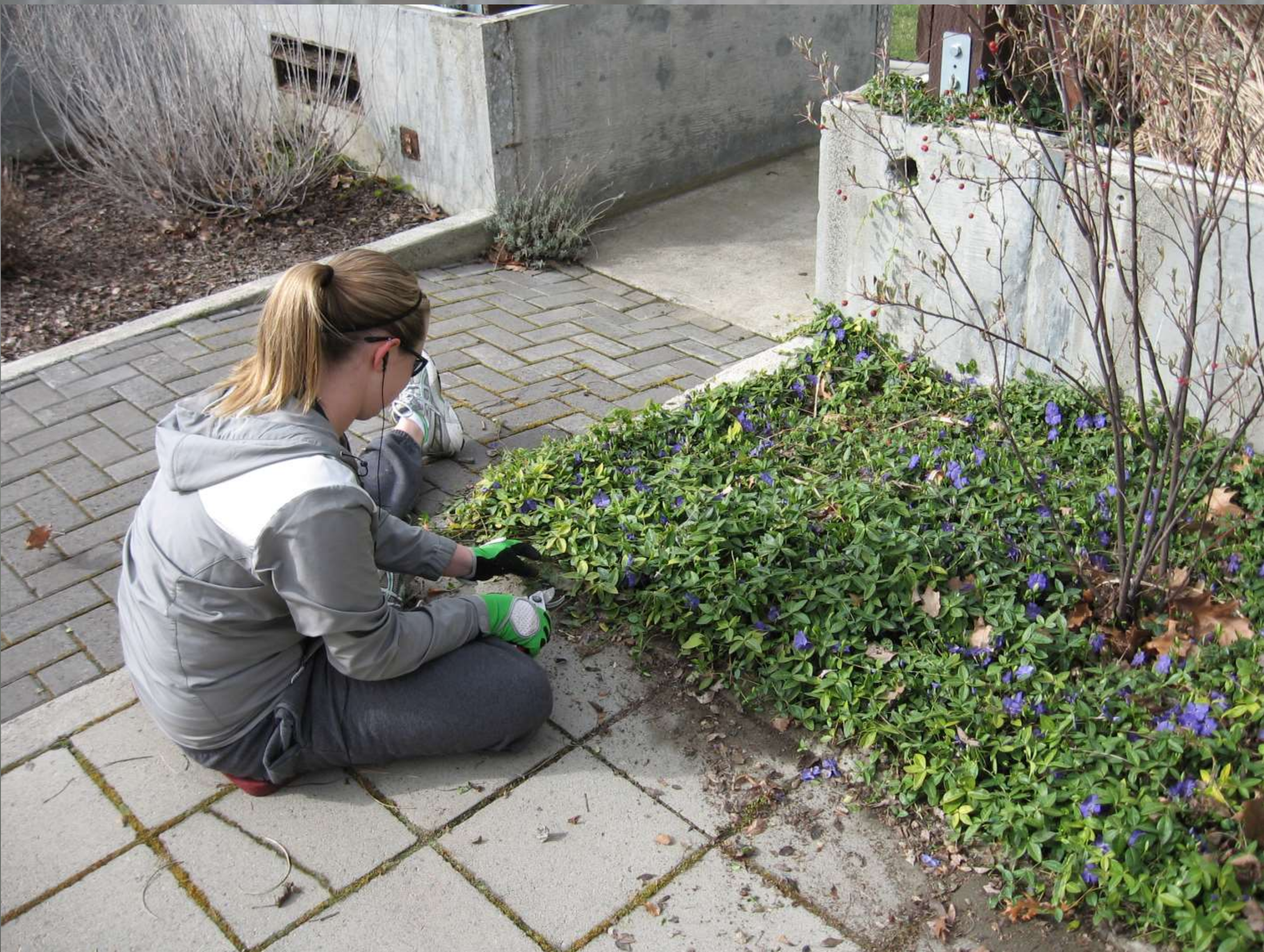
Here I am seen trimming back the Vinca minor in the shade garden.

Since I began my internship in February, there was not much that I could do outside at the time. Instead, I researched many grasses that would grow well in this area, and comprised a list of them to determine which ones to use in the plan for the fourth phase of the garden. After designing a layout resembling the two plant beds outside, I chose six grasses that would grow well together and look great throughout the year. Then I drew these grasses into the plan pictured below, referred to as phase 4 or the grass garden. Having the opportunity to design as well as maintain certain aspects of the Display Garden will translate to future classes and career paths, and this experience has furthered my interest in landscape and horticulture management.