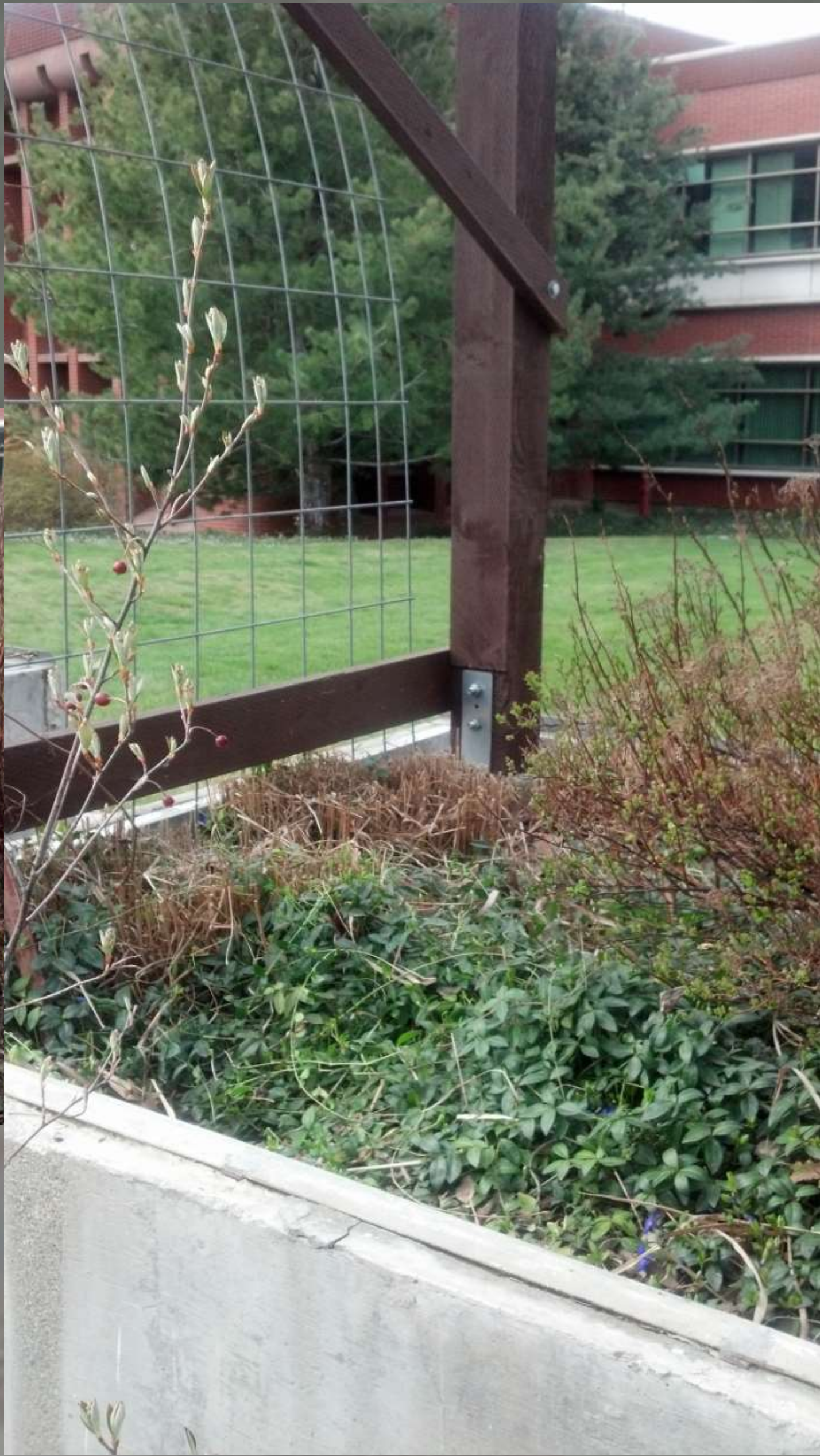
This is some Miscanthus, before and after being trimmed back.