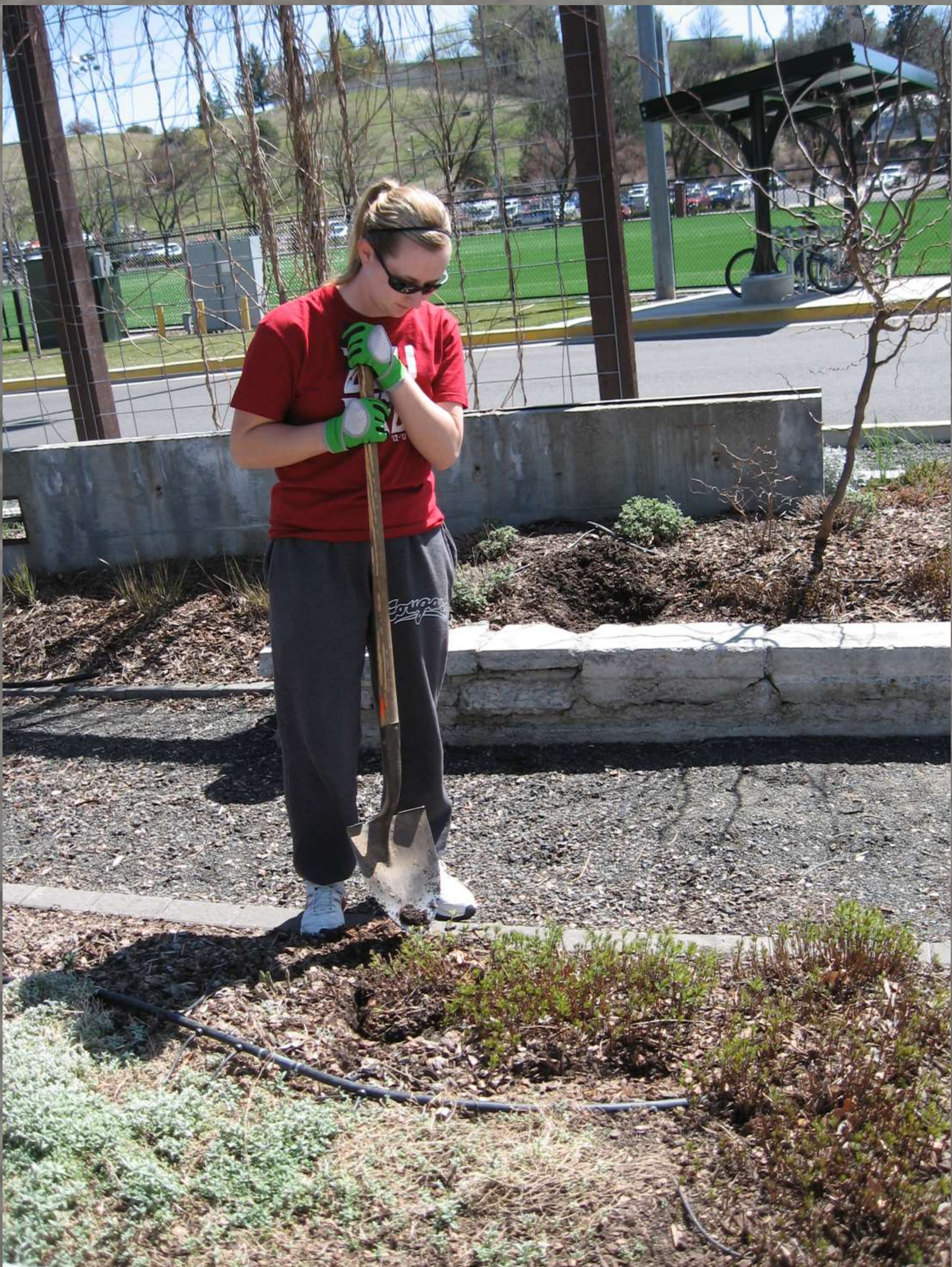
Here I am separating a section of coreopsis to be transplanted in another bed.