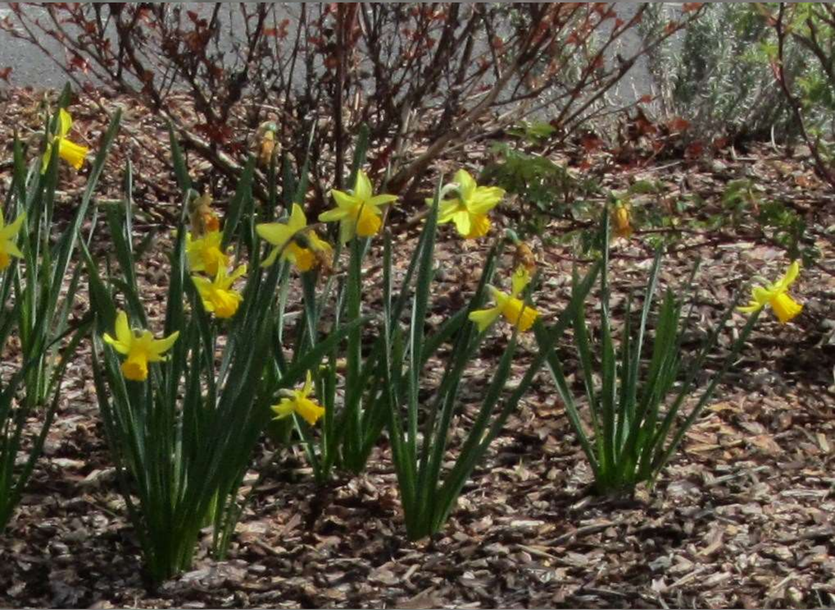
Background picture is a portion of the waterwise garden

Once the weather was nice enough to work outside, I began to clean up leaves and trim back some of the ground covers in the shade garden. While working outside I also: • Worked on trimming back various plants in the sun garden such as the feather reed grass, cone flowers, and chrysanthemums • Trimmed back the Russian sage and lavender featured throughout the entire garden • Participated in transplanting of irises, coreopsis, and feather reed grass • Watered these plants after transplanting • Assisted with pruning the roses and grape vines • Raked, swept, and picked up litter throughout the entire garden on various occasions