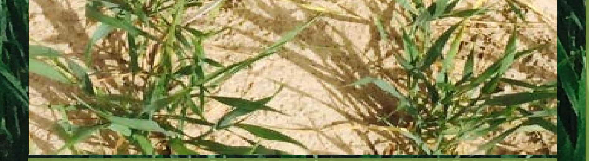
Figure 2. Each tube was planted in between rows one and two of a six-row plot to ensure they were both clear of equipment and angled towards actively growing roots.