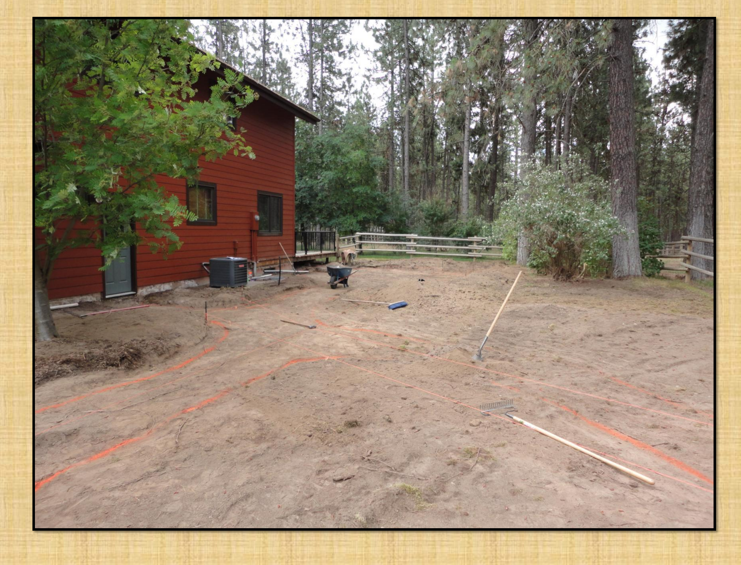
Before and after photo of a job site where I laid pavers