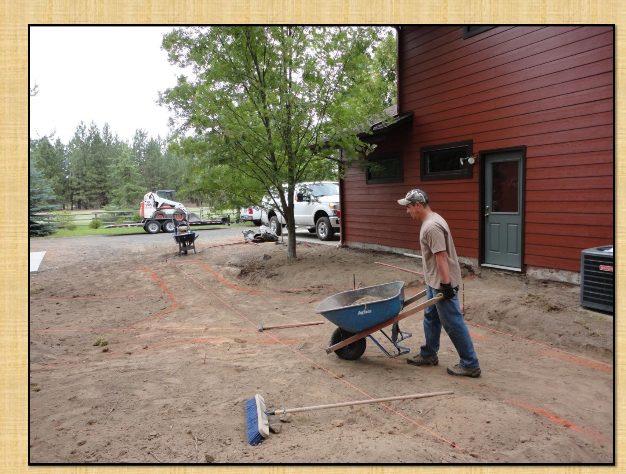
Prepping site for pavers

I did many of my office duties independently but everything I did was reviewed by my mentor and he gave me pointers to help me along the way. For duties in the field, I worked mostly with co-workers and the foreman.