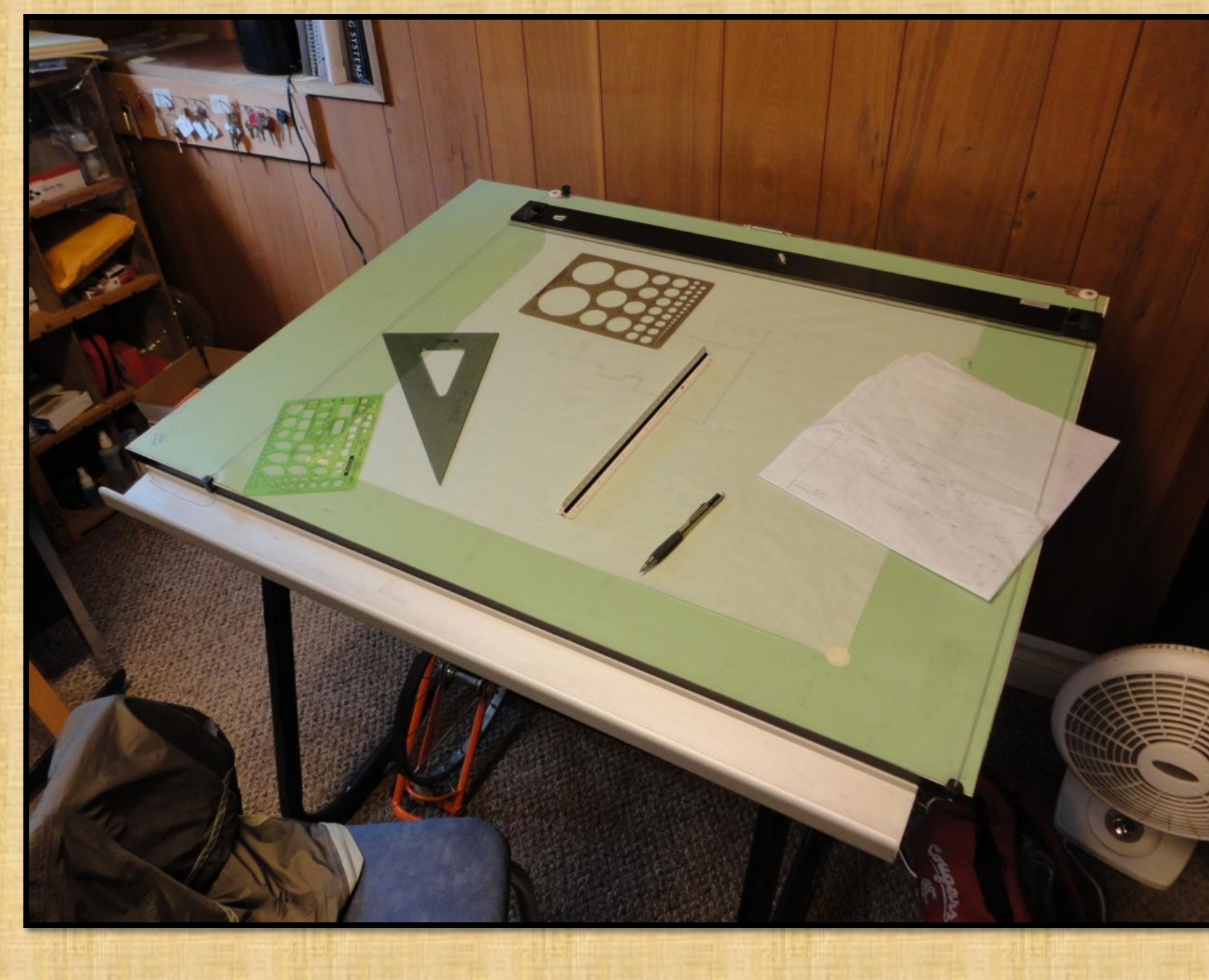
My Drafting Desk