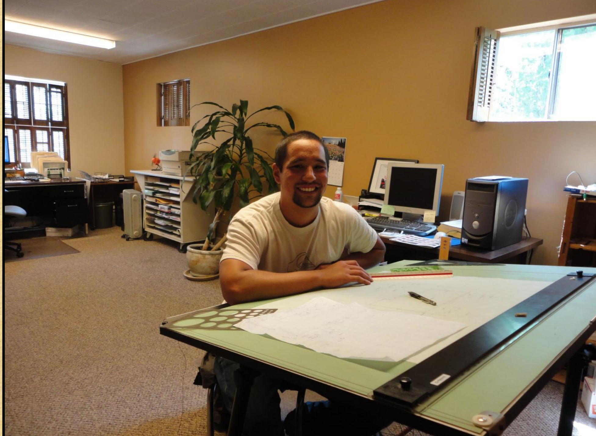
Drafting up a site analysis