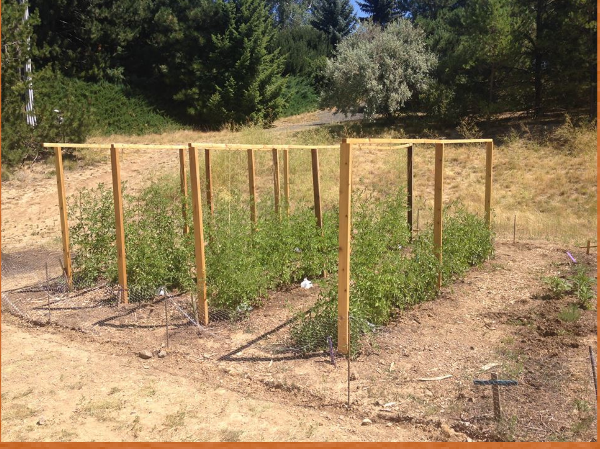
Tomato plants at Lincoln Middle School in Pullman, WA. Two YMCA classes are taught each week here. To the Right are labels of the two types of tomatoes grown here: Mexican Midgets and Early Wonders.