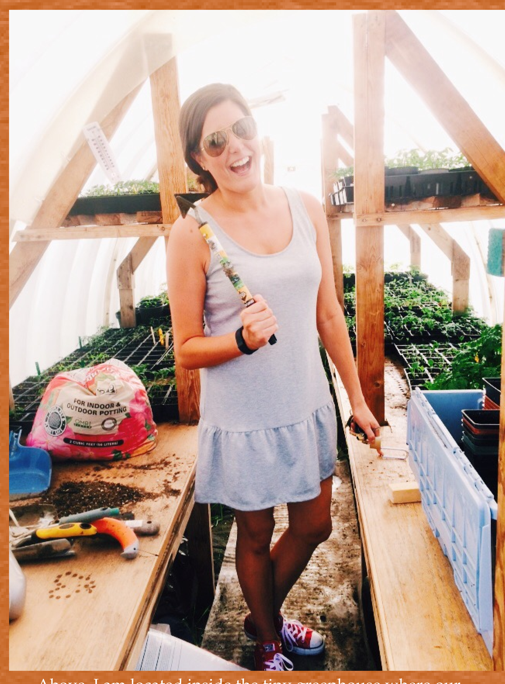
Above, I am located inside the tiny greenhouse where our plant starts are housed and many of my hours were spent in the beginning of my internship.

increase the amounts of fresh produce in needy households. BYH now gleans, gathers, and grows produce to help donate thousands of fresh produce each year.