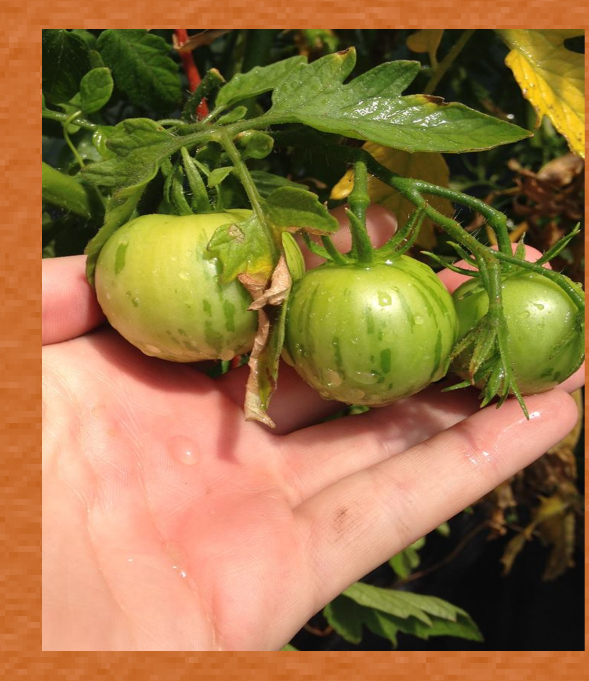
The start of what will be beautiful, organic, heirloom tomatoes.