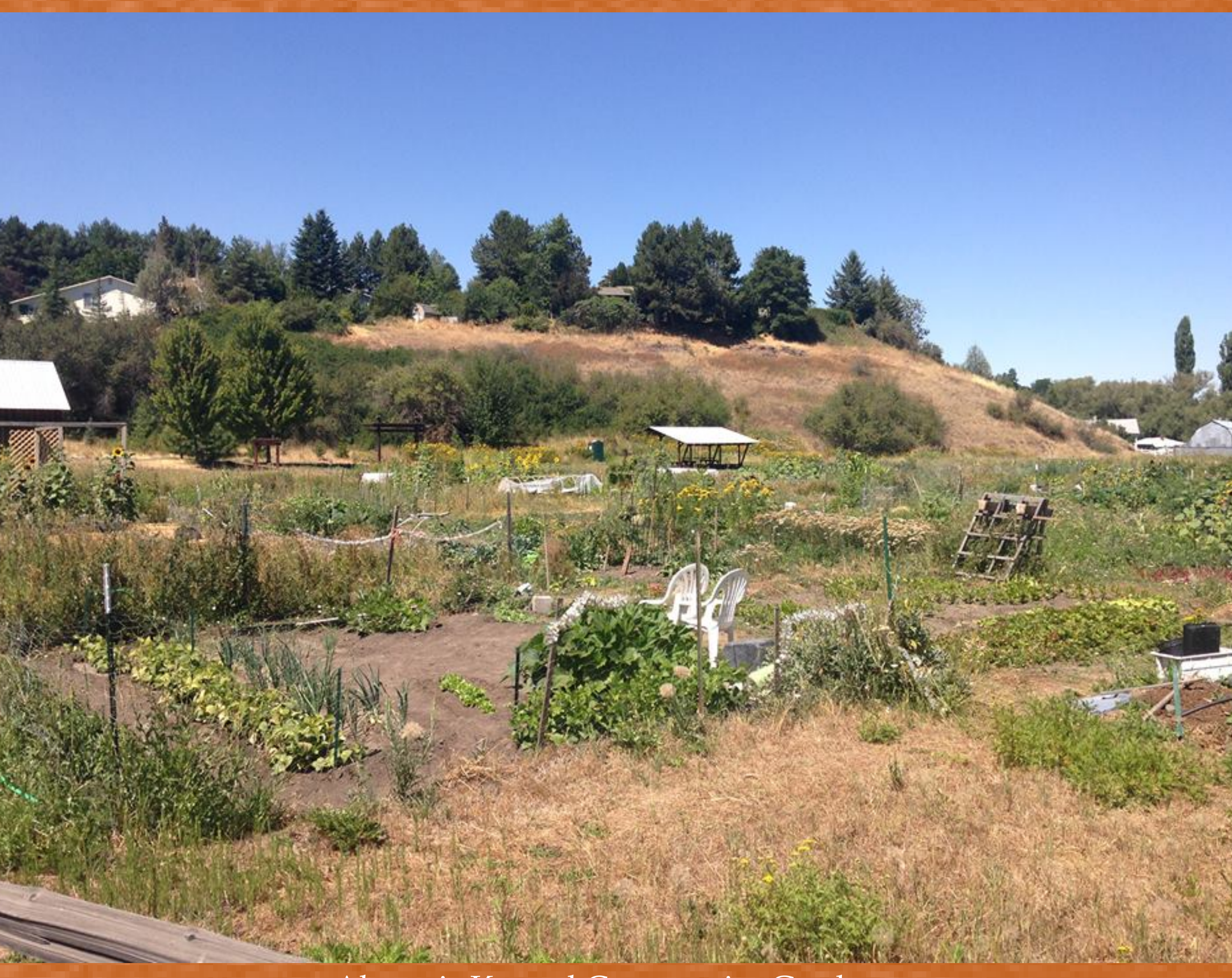
Above is Koppel Community Garden