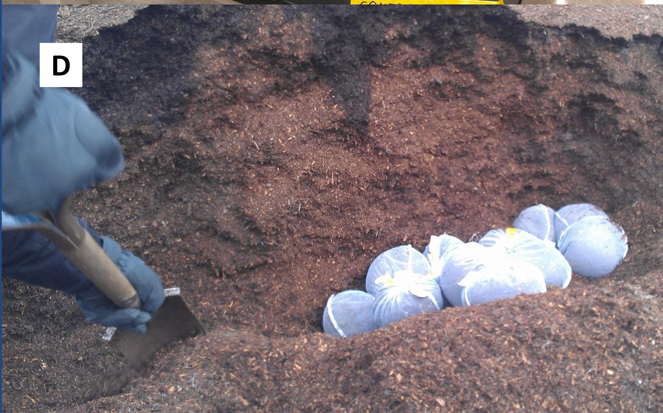
One of the projects I was involved with was making the compost batches with various iron sulfate and iron gluconate concentrations which are the ones used for evaluation of contaminated soil remediation. We used feedstock from the WSU composting facility as starting material. We weighed out about 1000 grams of feedstock, added the iron, and mixed thoroughly (A). Then placed the mixture in a bag with labels and tied them up (B). We then went to the WSU compost facility and buried them into the center of the pile where it is the hottest (C and (D)).