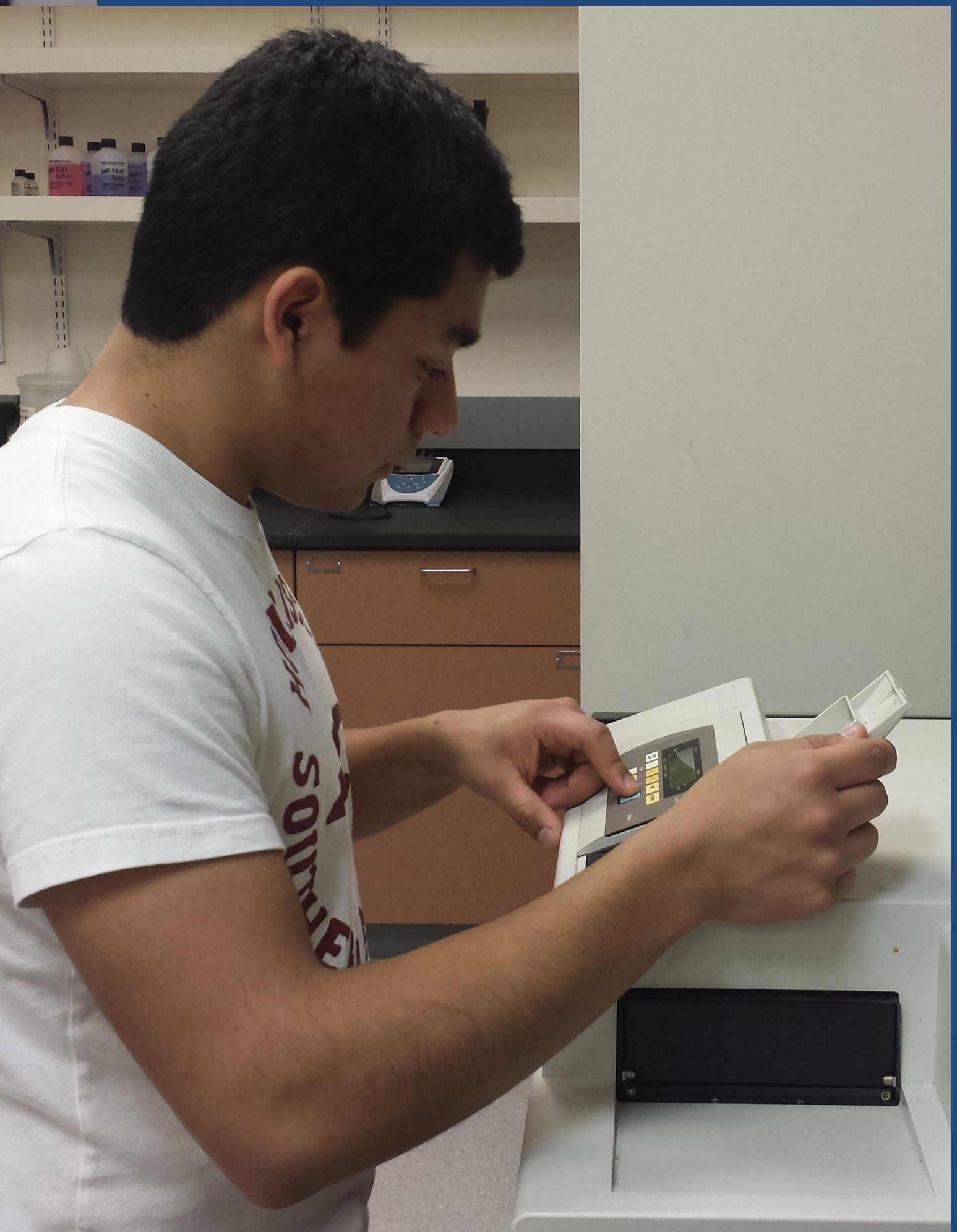
(Far Left) During my research experience I was able to learn and use an atomic absorption spectrometer, which is the machine we used to measure calcium, magnesium, and lead concentrations (middle). I was also able to use a Spectramax UV-Vis spectrometer to analyze phosphorous concentrations.