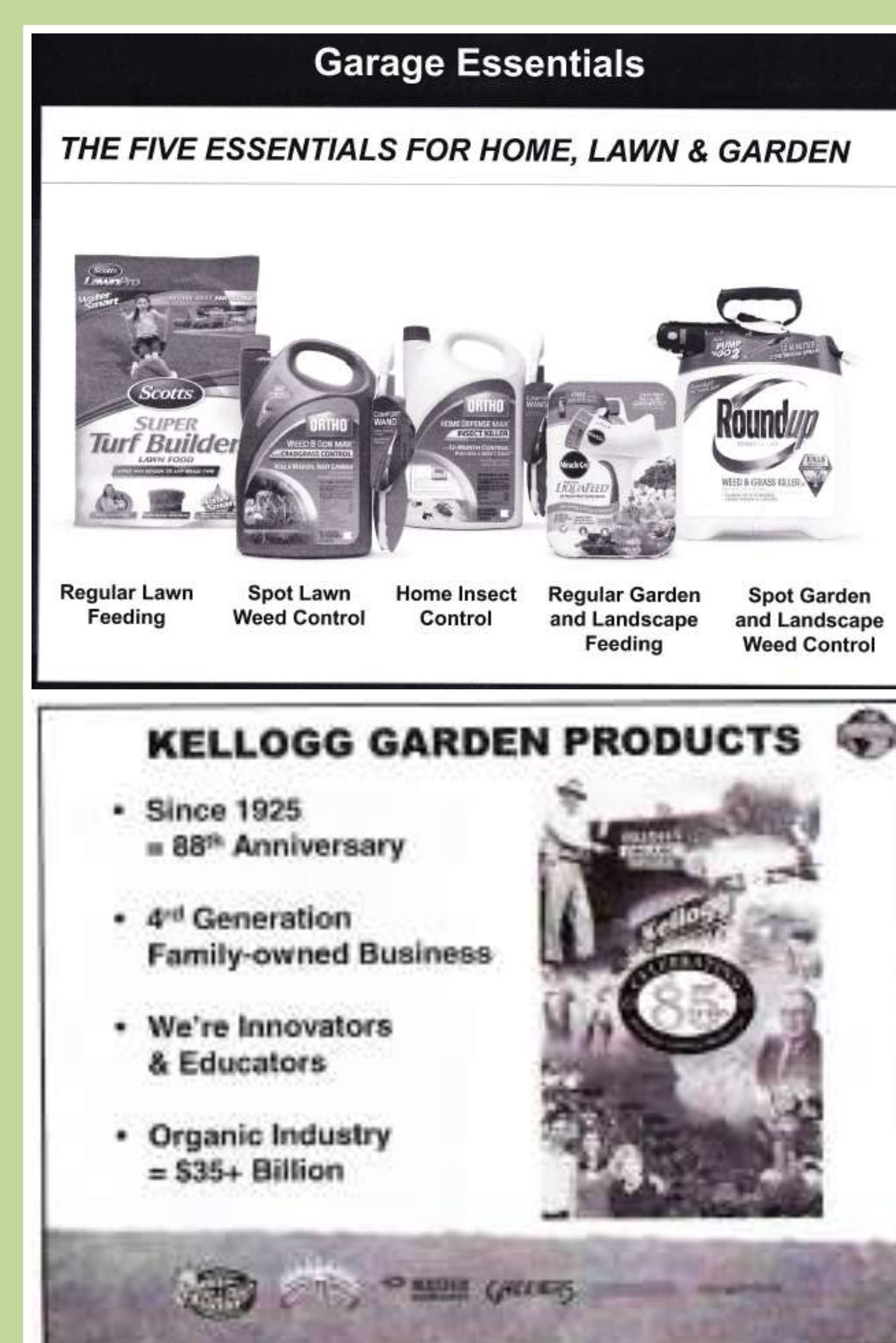
Pages from packets we were given from the Scotts and Kellogg company representatives at the seminar