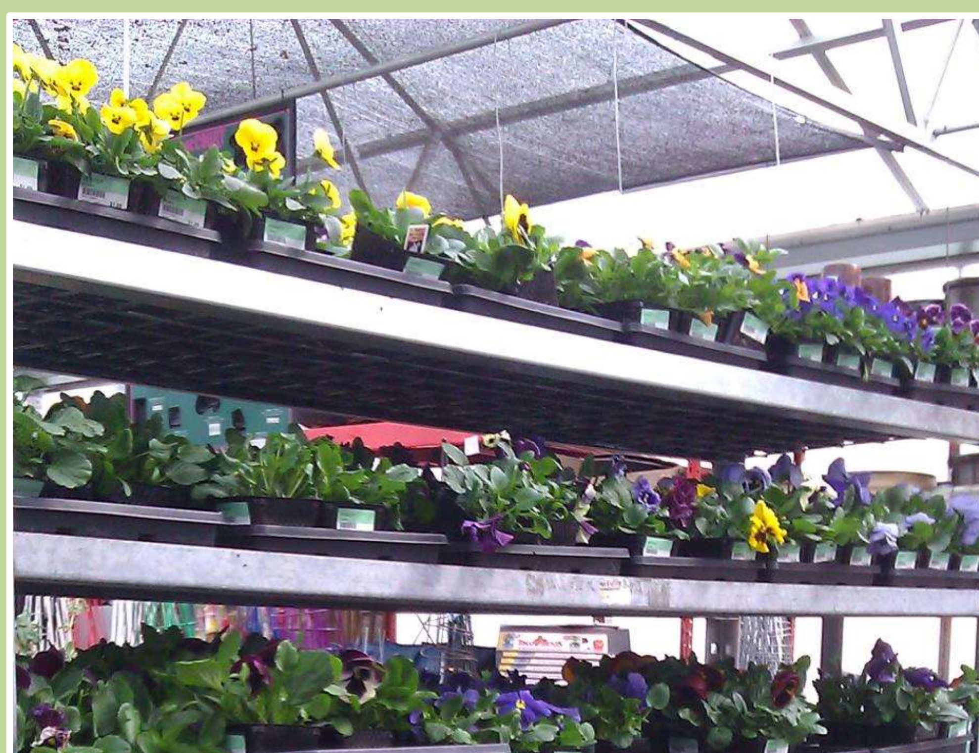
Rack of newly shipped pansies in the greenhouse