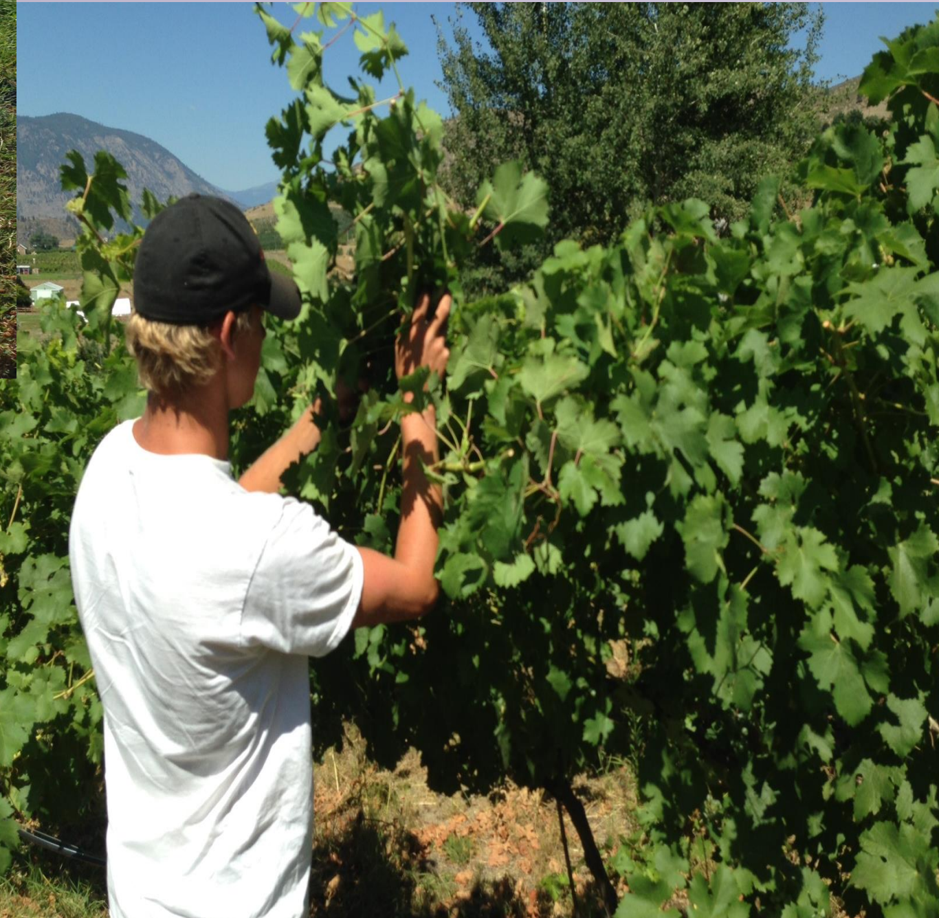
Tucking older vines