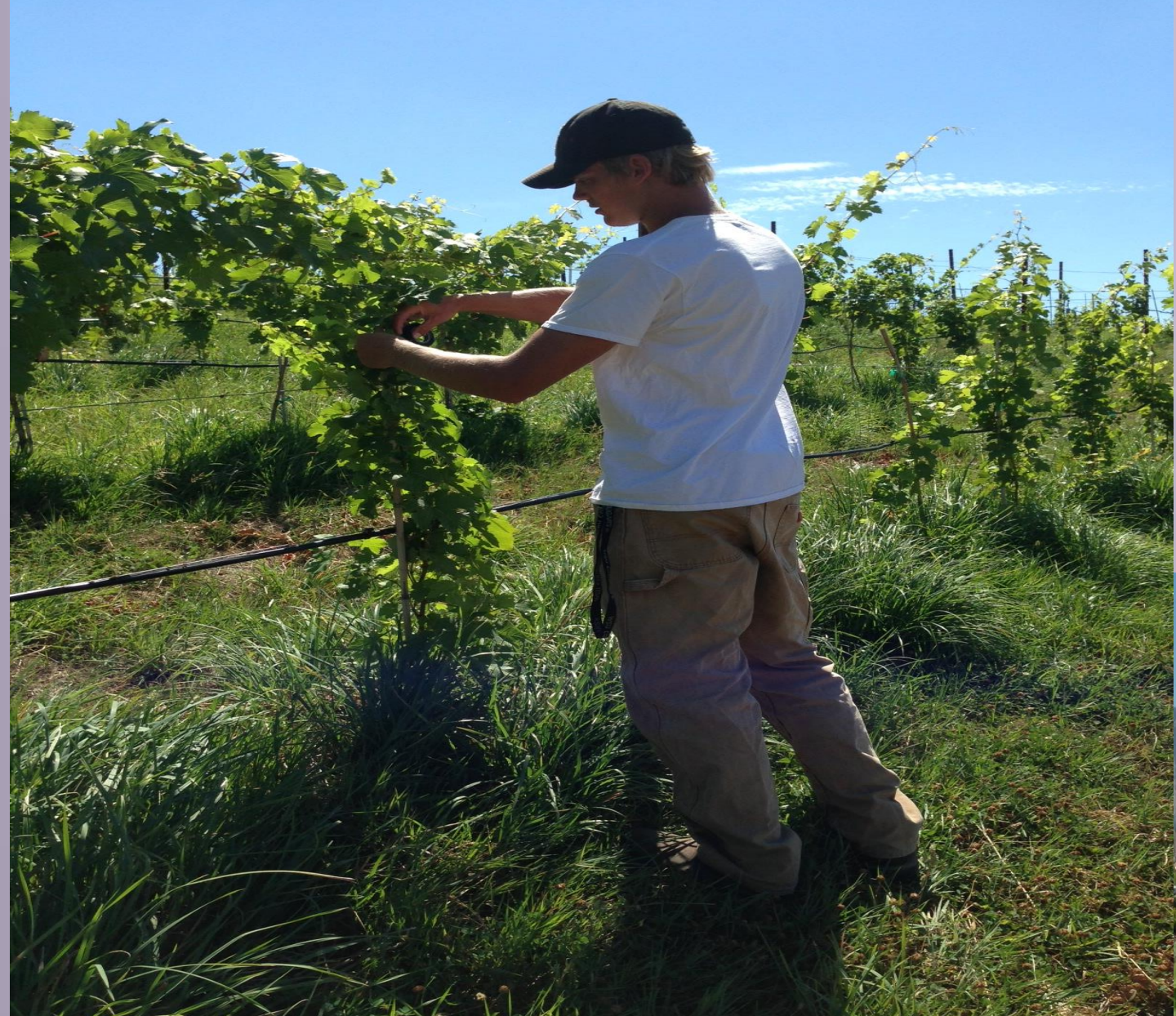
Training younger vines