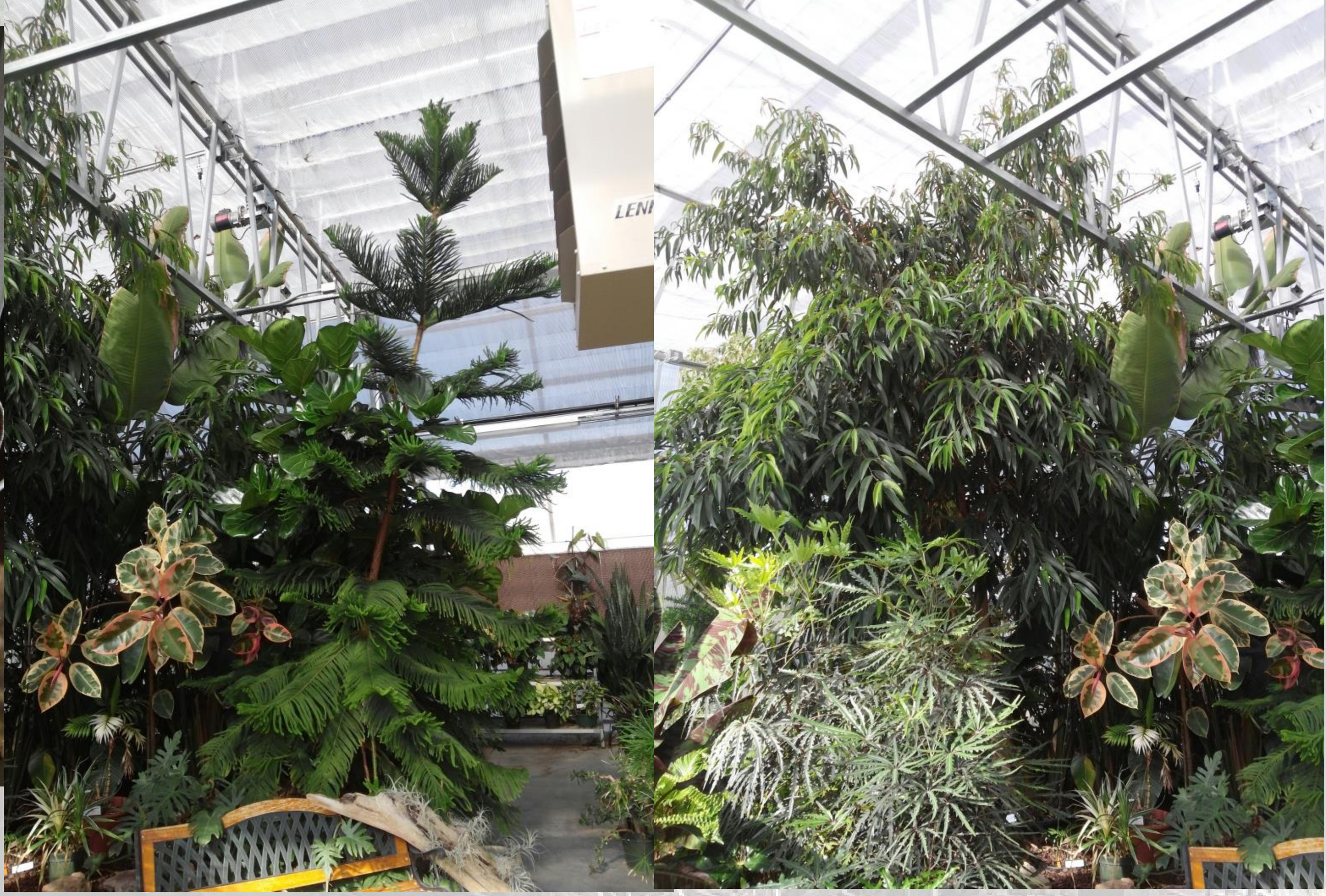
The Norfolk Pine and the Allie Fig will be trimmed in early September as they are starting to get too close to the shade cloth.