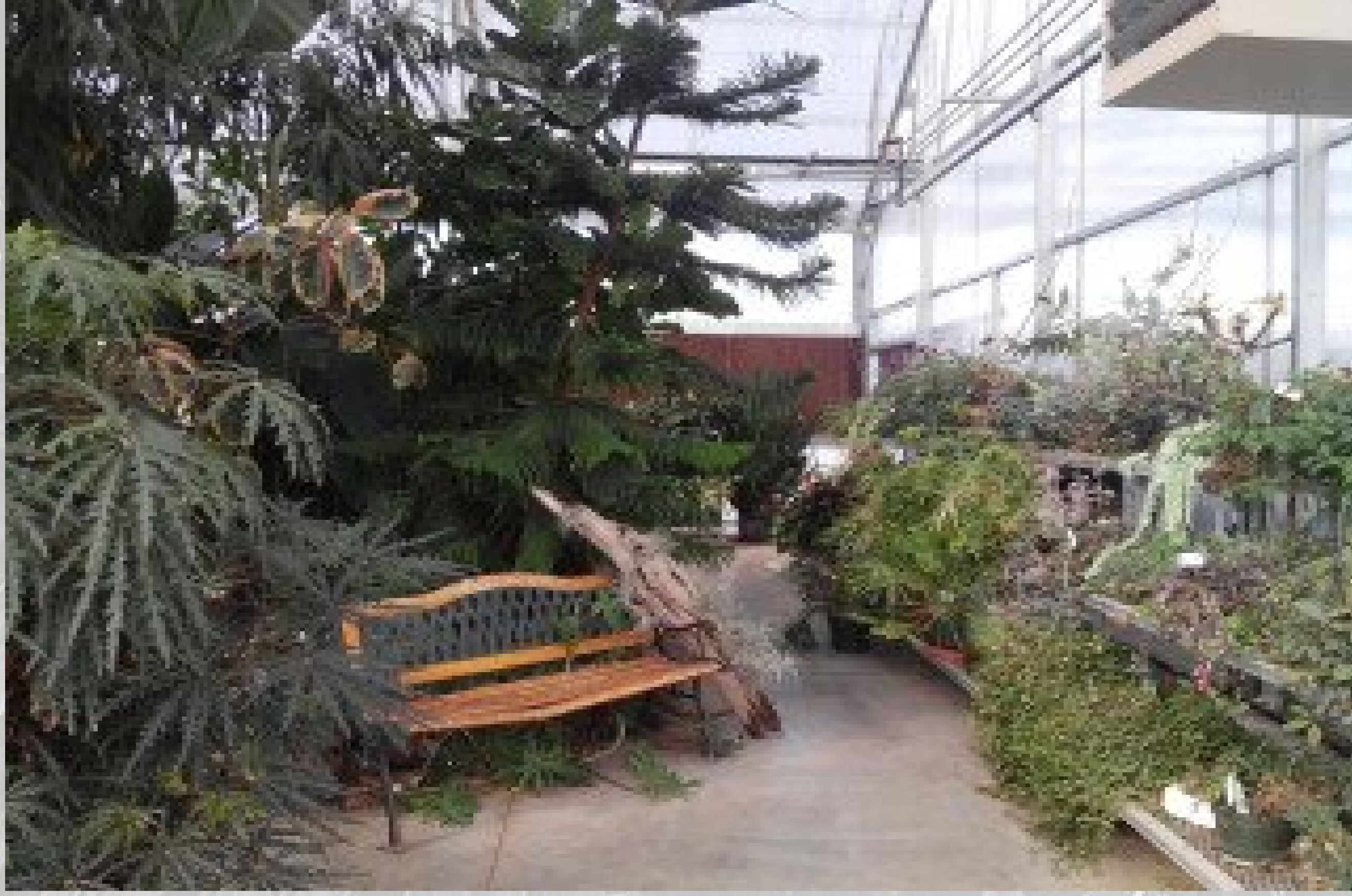
Picture above is before I took over care in the conservatory, picture to the right is from the end of July 2015