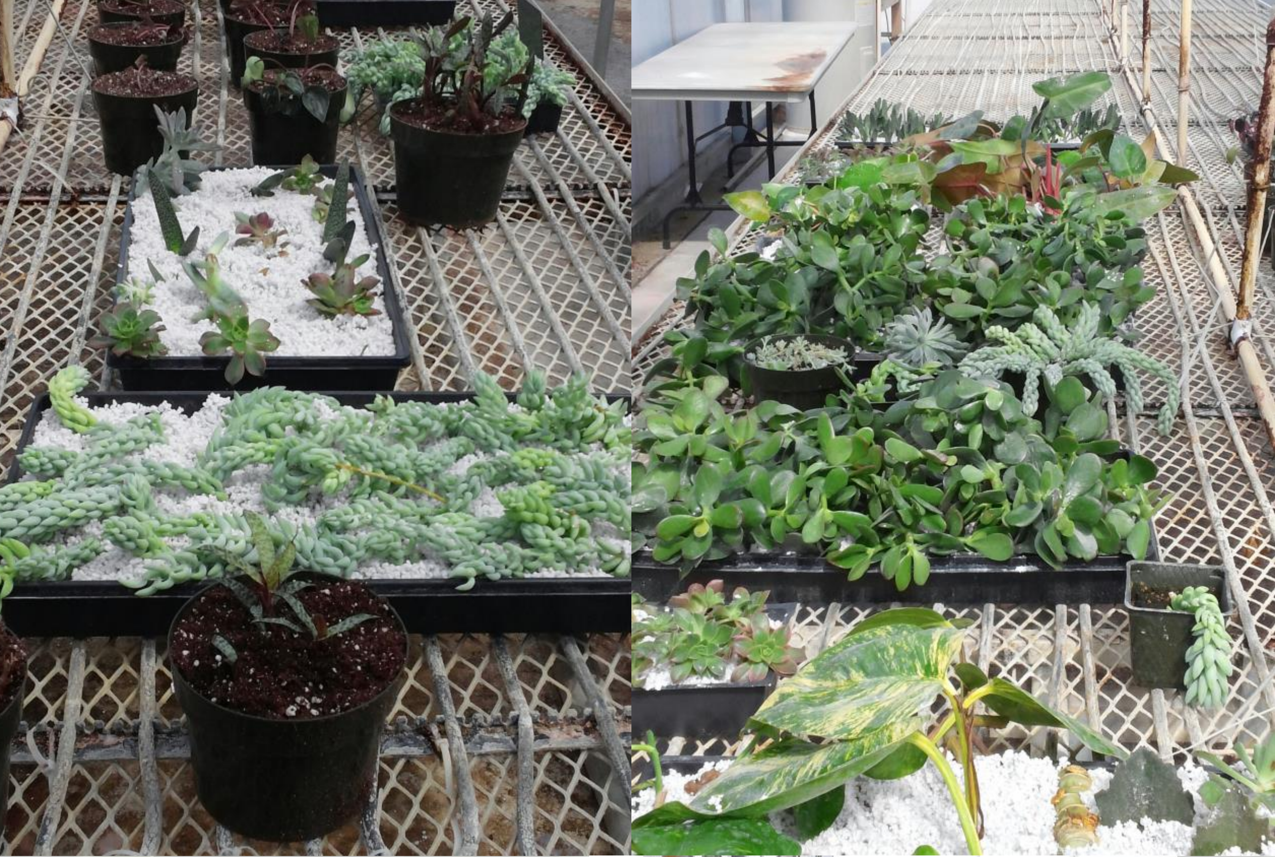
The two pictures above are images of the propagation table. Here are more of the plants that will be sold this fall. Once they are rooted they will be transplanted into the potting mix. To the right is a Sansevieria that was separated into smaller pots for the sale.