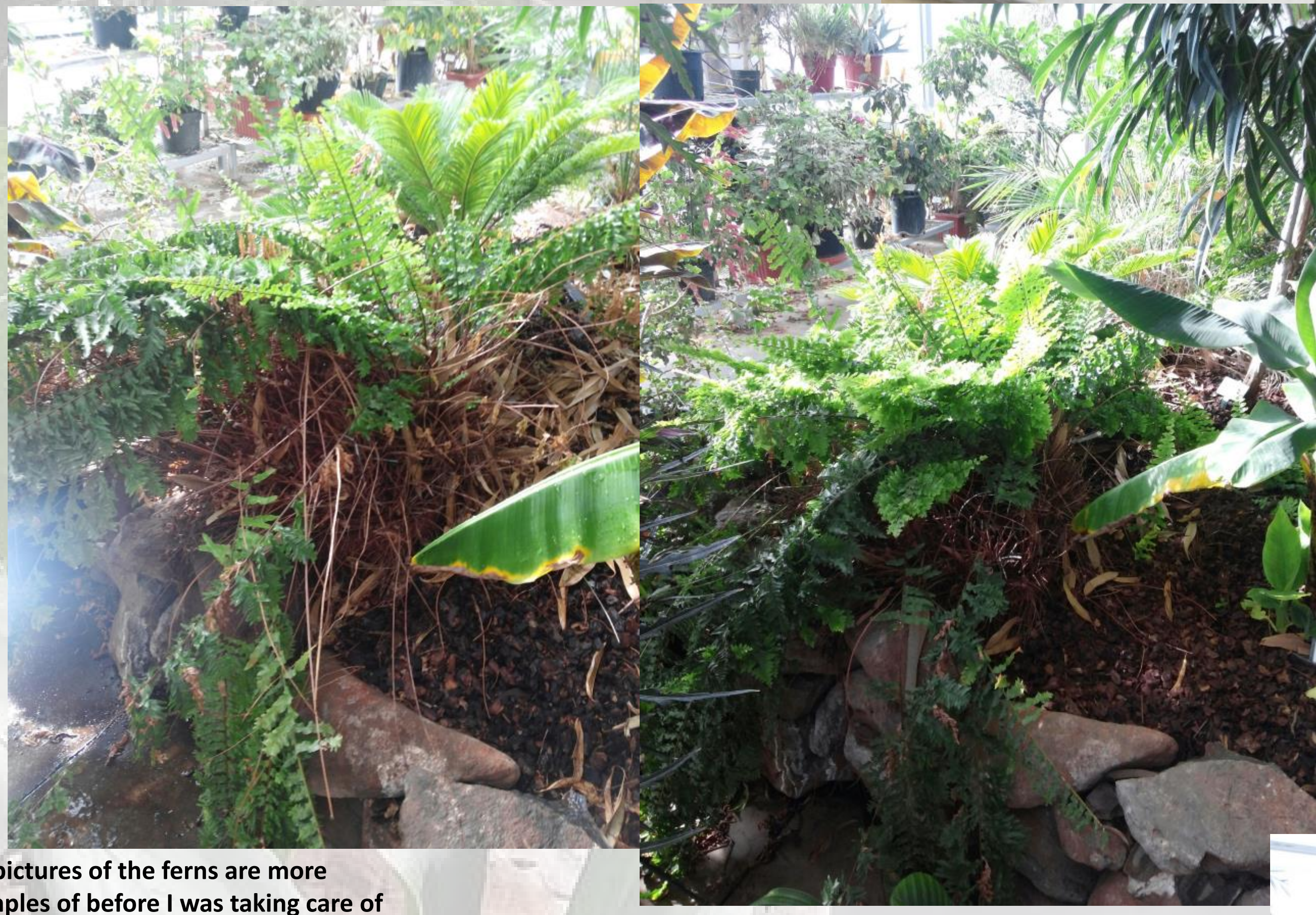
The pictures of the ferns are more examples of before I was taking care of the greenhouse, and then again after I had been caring for the conservatory for a couple months. The fern above and to the left is before, and the fern to the right is after. The pictures to the right are the same, the one on the left is before I took over and the one on the right is after. These pictures show the importance of maintaining appropriate water levels and regular watering.