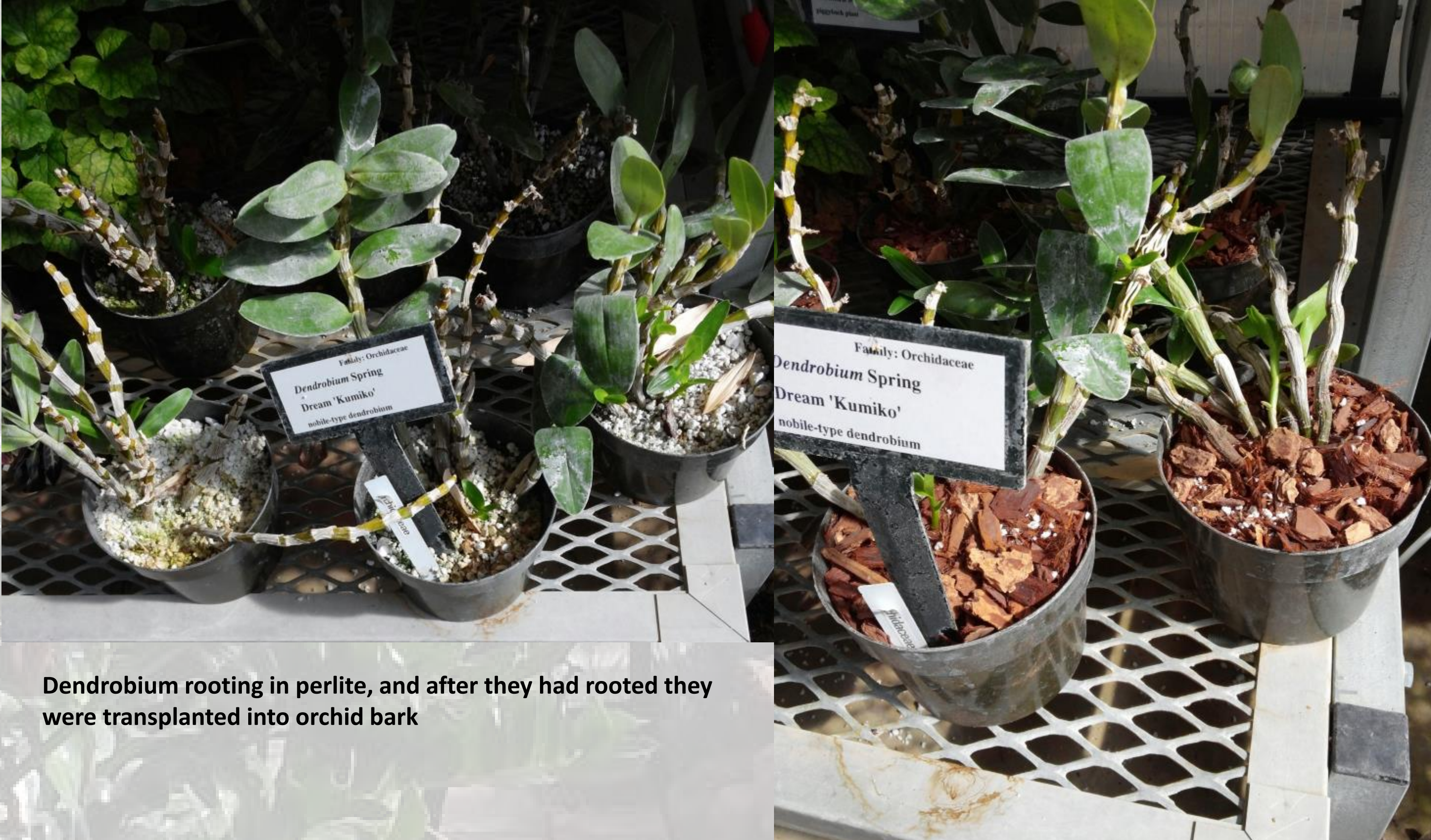
Dendrobium rooting in perlite, and after they had rooted they were transplanted into orchid bark