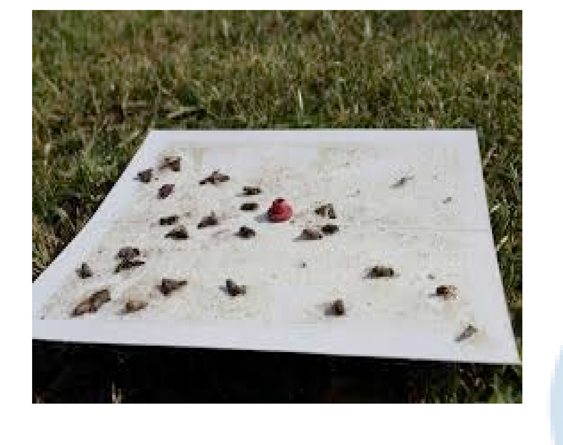
Here is and example of codling moths caught in an apple orchard using liners and luers

G.s. Long Company is a chemical and fertilizer company that is from Yakima, Wa, This company provides growers with solutions for any problems that the growers might face throughout the growing season of their crops. The main solutions that G.S. Long gives are for consulting purposes, crop protection and delivering chemicals that are needed.