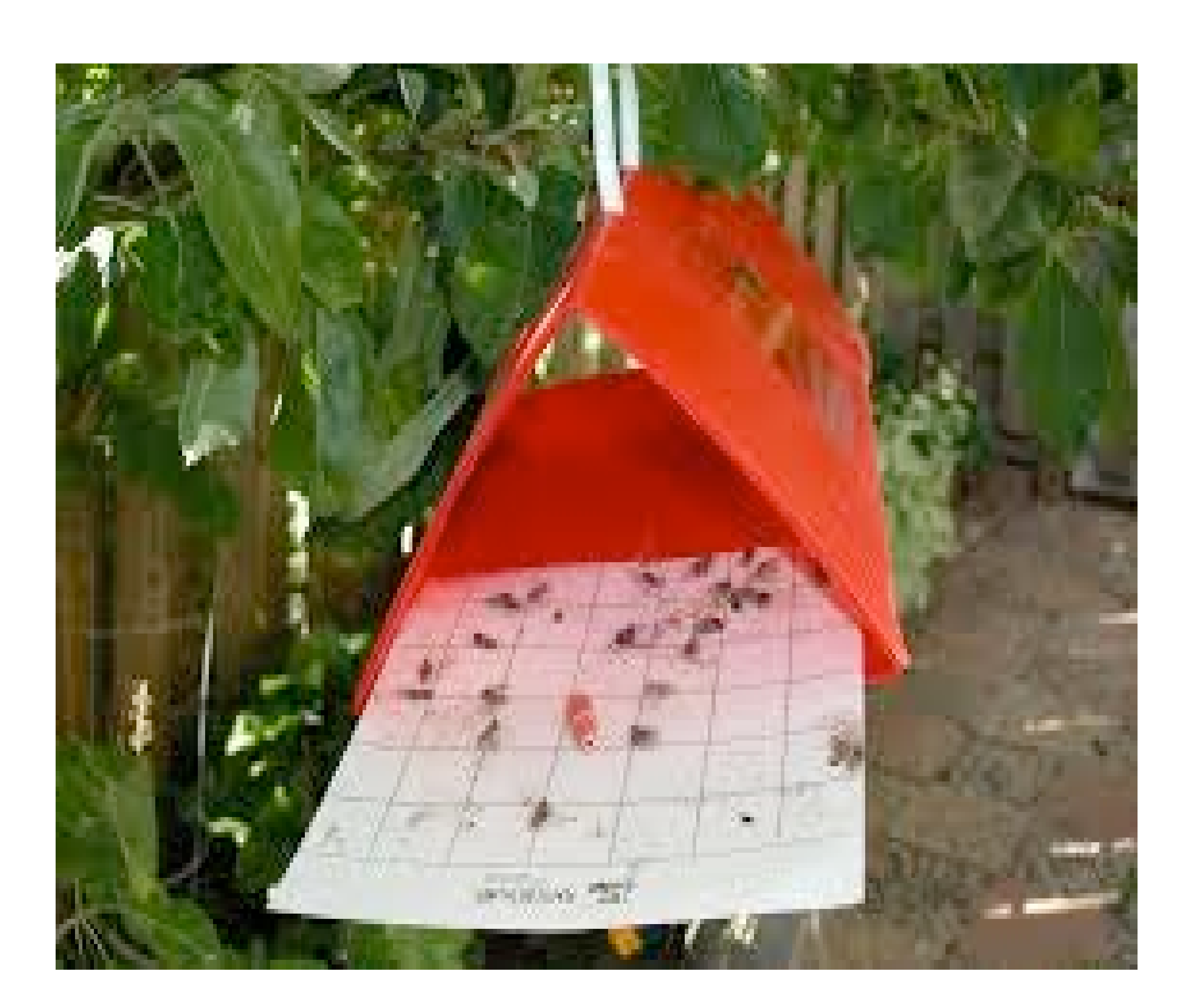
Example of what the traps look like in the orchard

This experience will help me with my professional growth because it taught me a lot about how to be successful in the agricultural ndustry. This internship helped me improve my communcation skils. I learned how to communicate more clearly and on time. This was very important throughout this internship experince because the job relied heavily on communication ranging from letting the consultan know the trap counts from asking question to my mentor when I was confused about anything. This internship also taught me how much time and commitment it takes during a full time job and the responsibilities that it comes with such as being on time and finishing your work within a resonable time. The last thing that this internship provided me with was working on my own, which hellped me think of decisions on the fly and allow me to work out my problems without relying on someone do it for me.