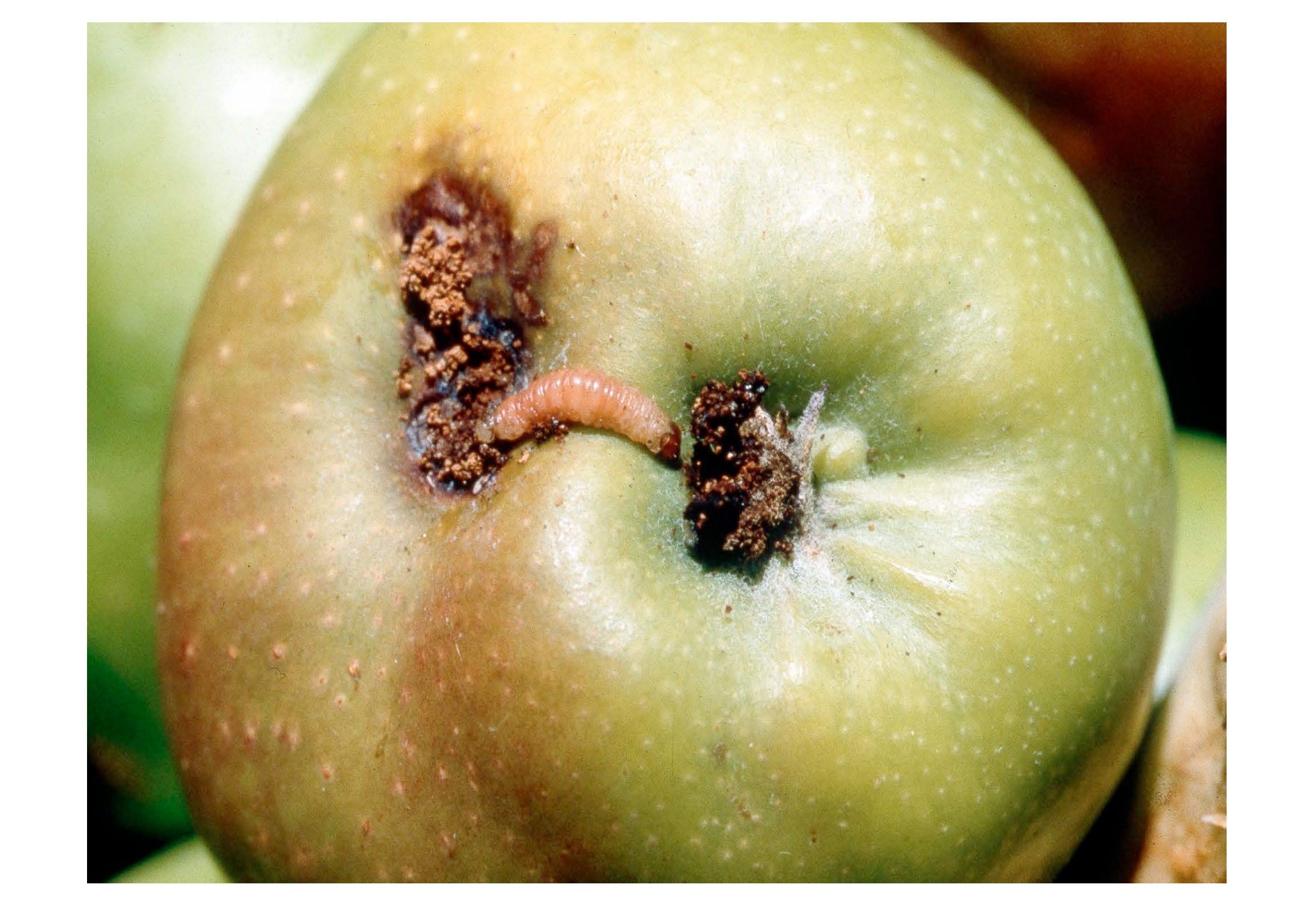
This is an example of what codling moths can due to your apple crop