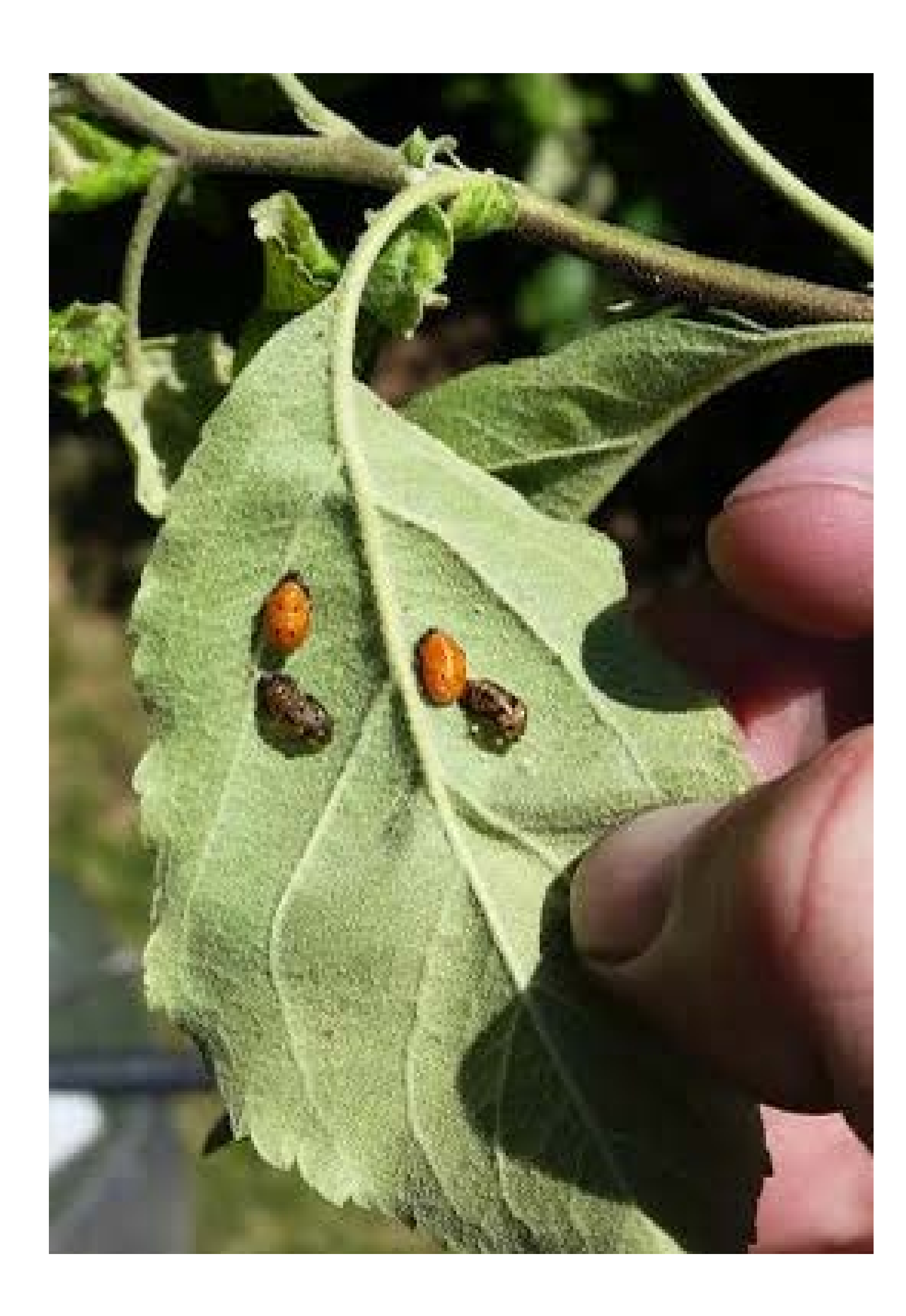
Lady Beetles pupating