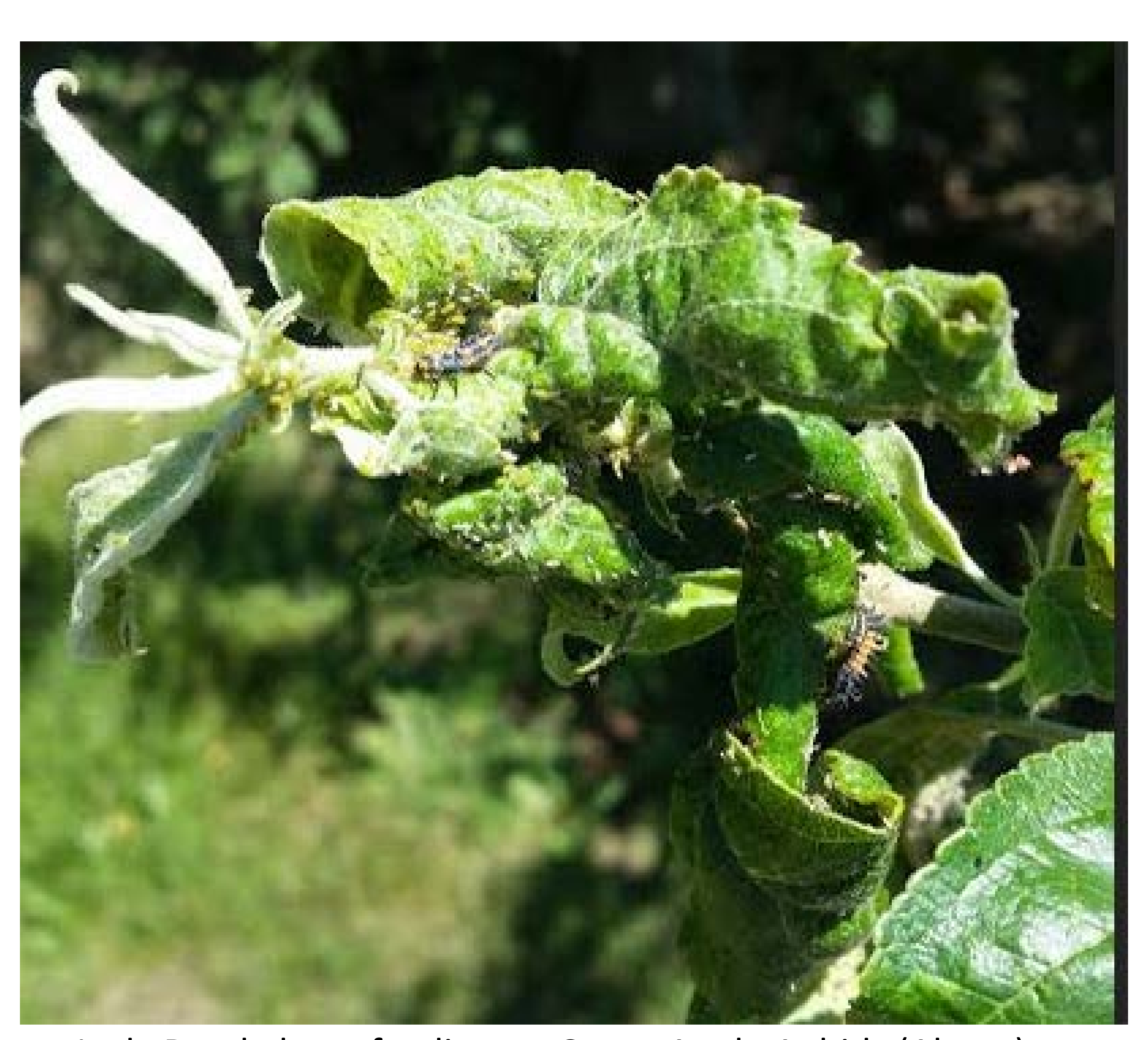
Lady Beetle larva feeding on Green Apple Aphids (Above). Ants and Rosy Apple Aphids cohabitating (Below)