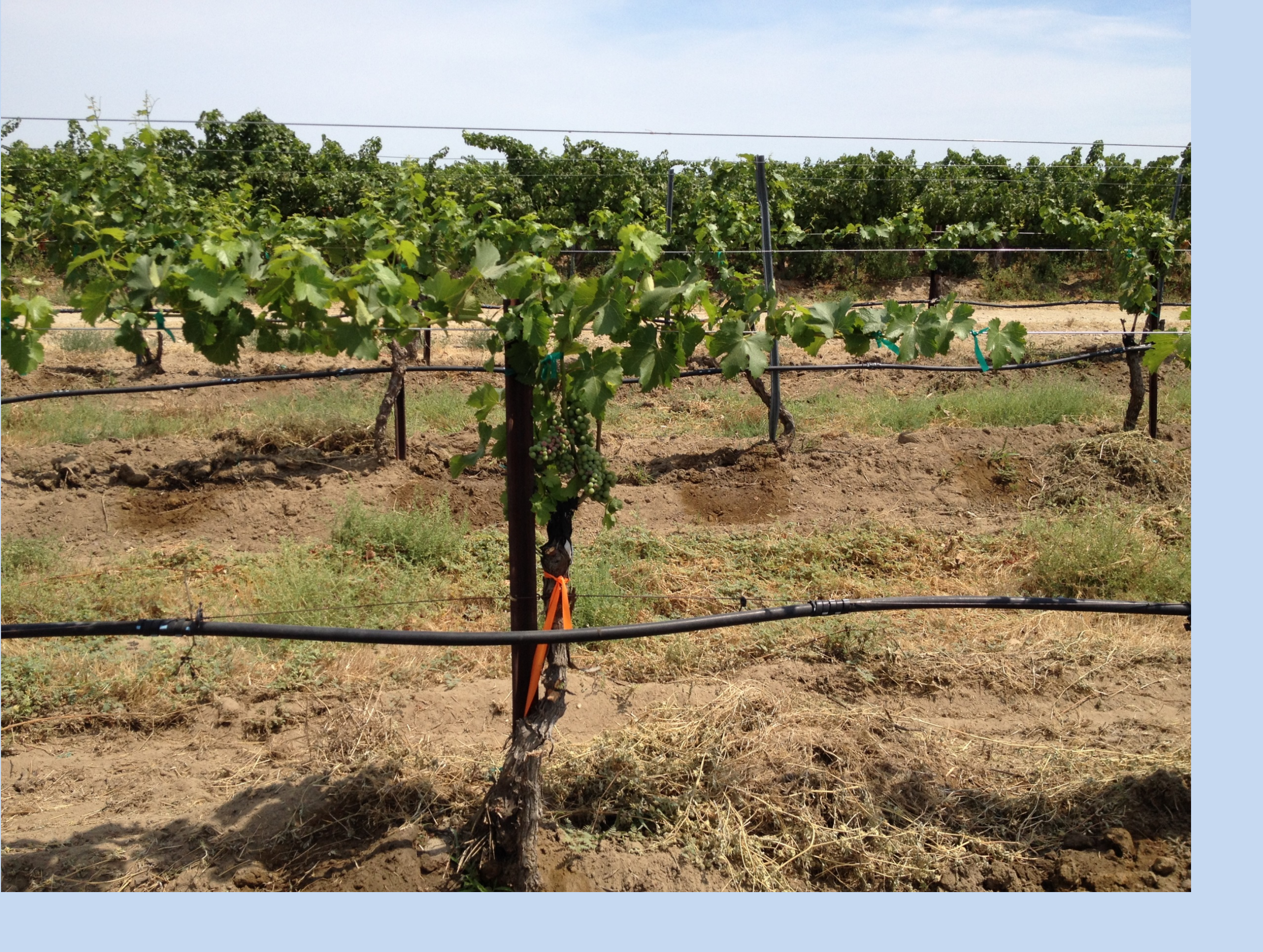
Granache grafted to a Sauvigon blanc root stock. I was in charge of collecting rate of growth data.