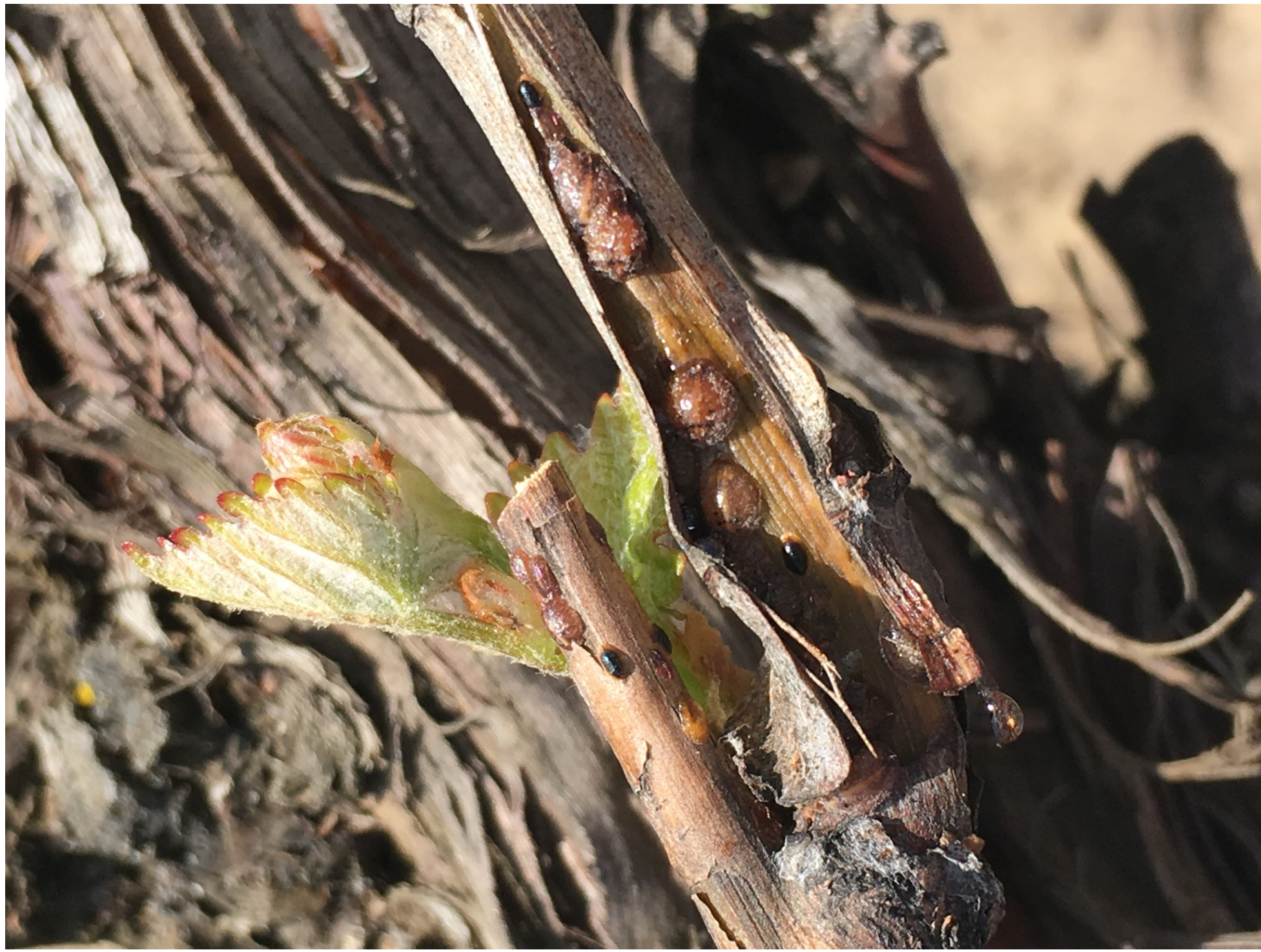
Scales found on the spurs of the vines