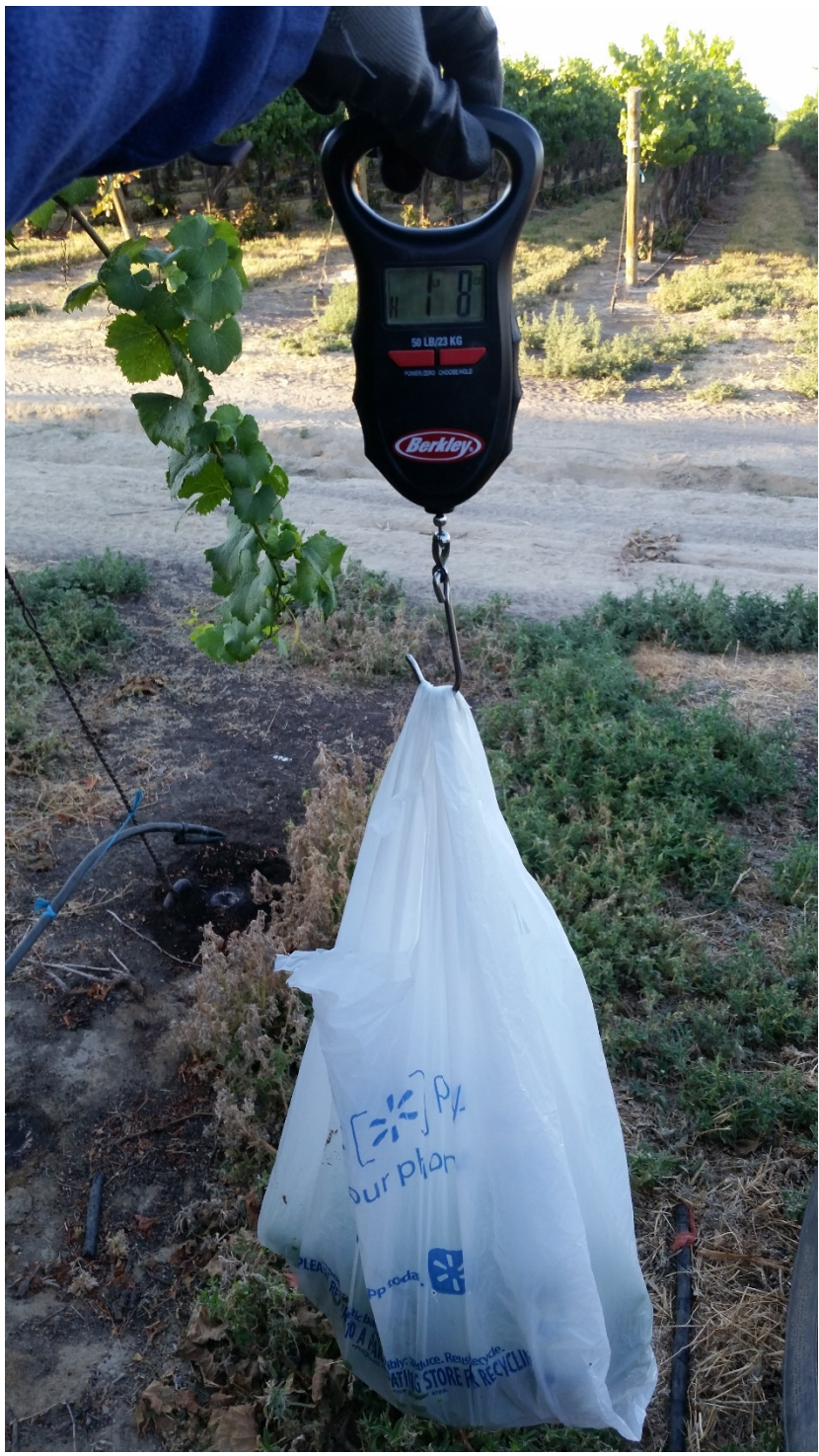
Method used to weigh clusters