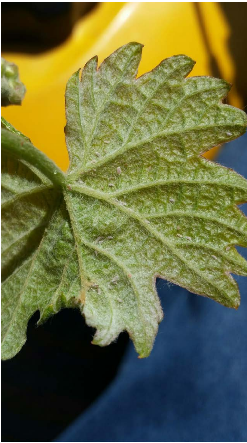
Mealy bugs found on the underside of the leaf