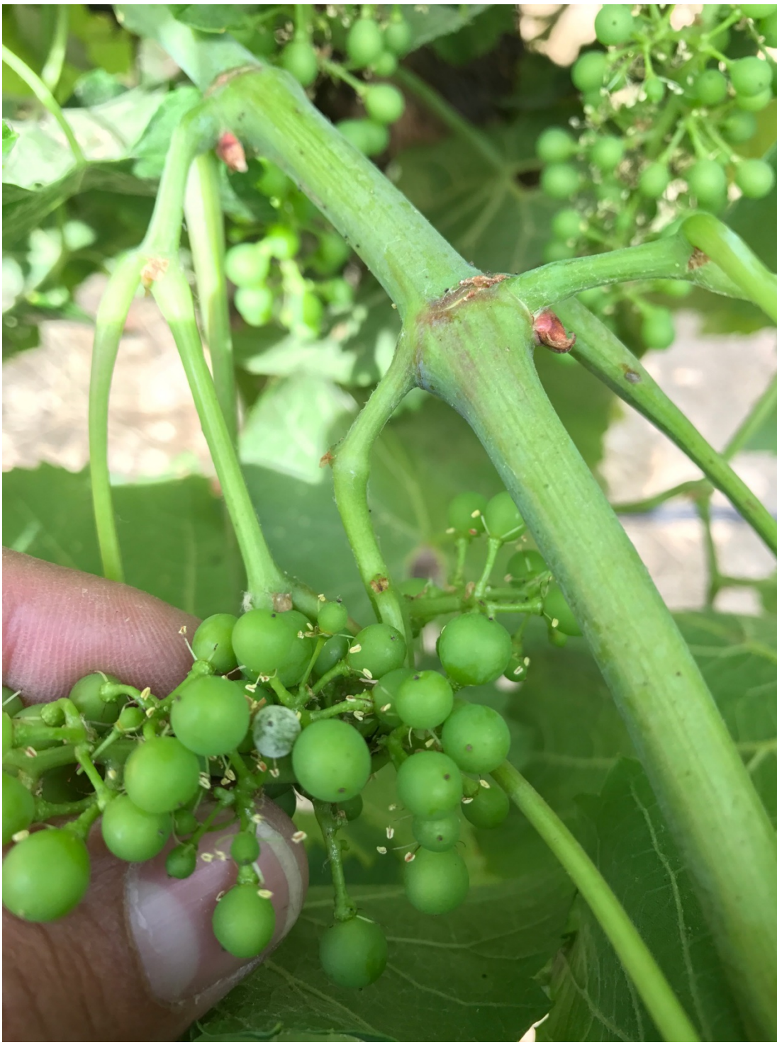
Single berry infected with mildew