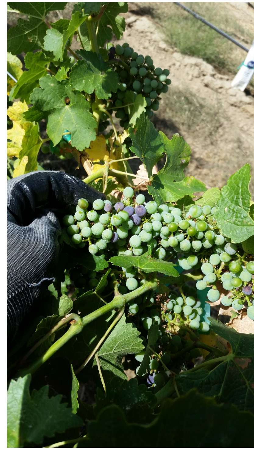
First signs of veraison beginning in the Horse Heaven AVA.