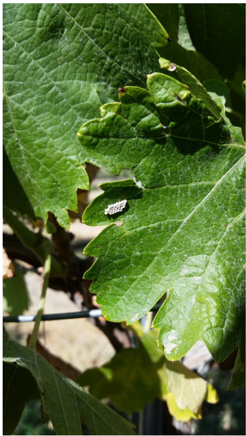
Eggs of a potential pest (stink bug)