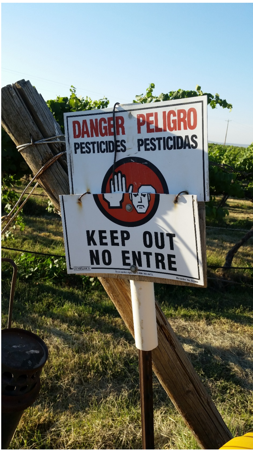
Safety in the work place was always stressed