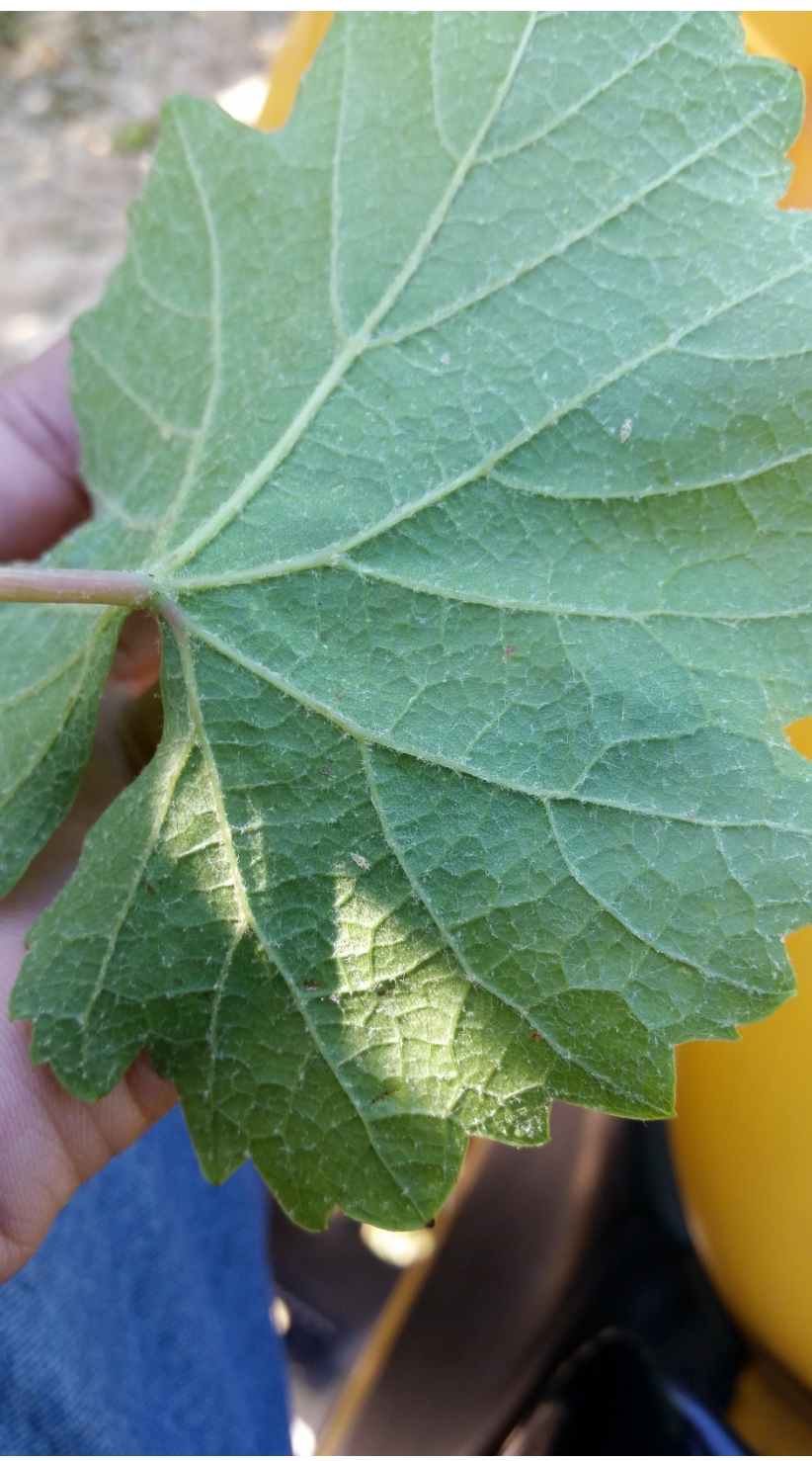
Leaf Hoppers (Virginia Creeper)