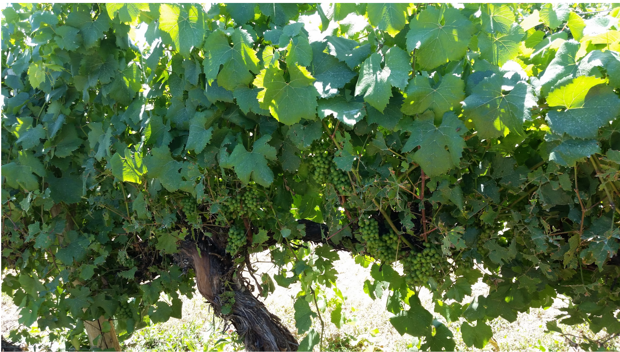
The vines after being mechanically leafed