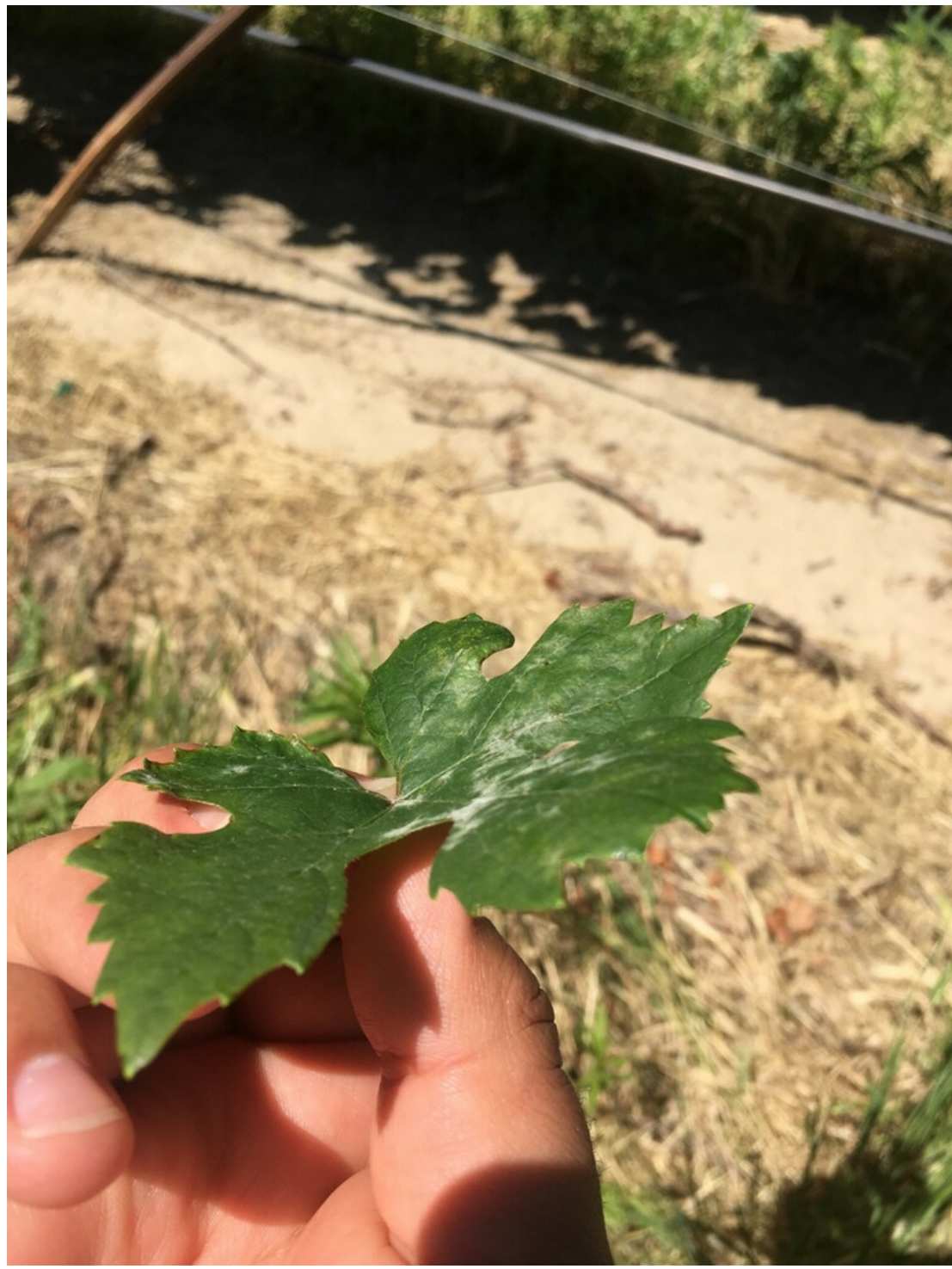
Powdery Mildew found on leaf