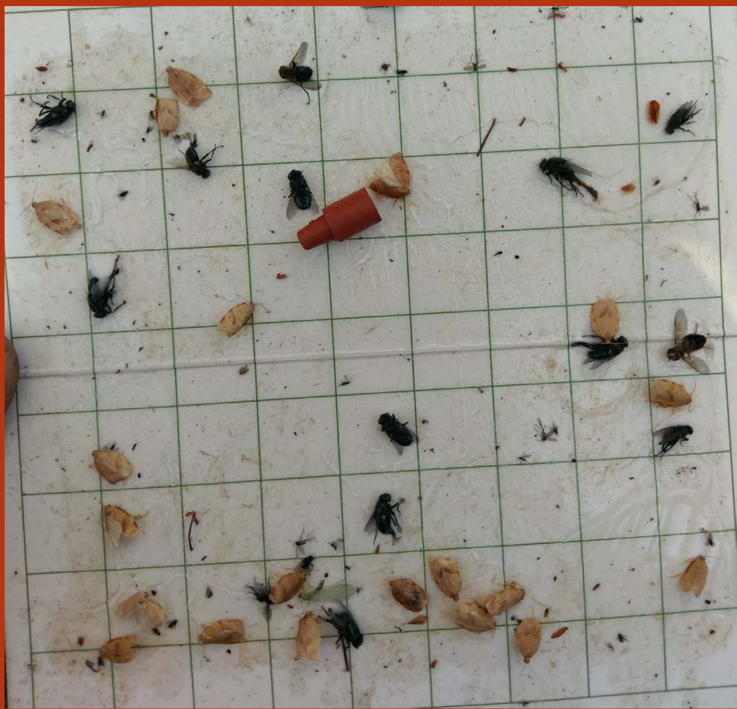
Fig. 1: Liner full of Oblique Banded Leaf-Roller