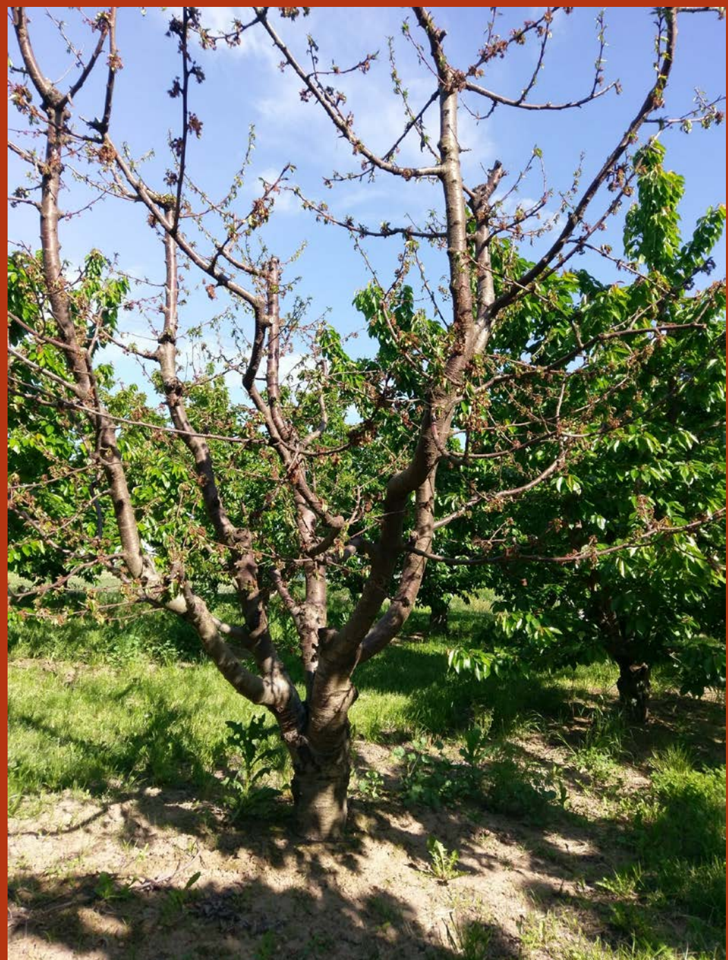
Fig. 3: Unhealthy Cherry Tree