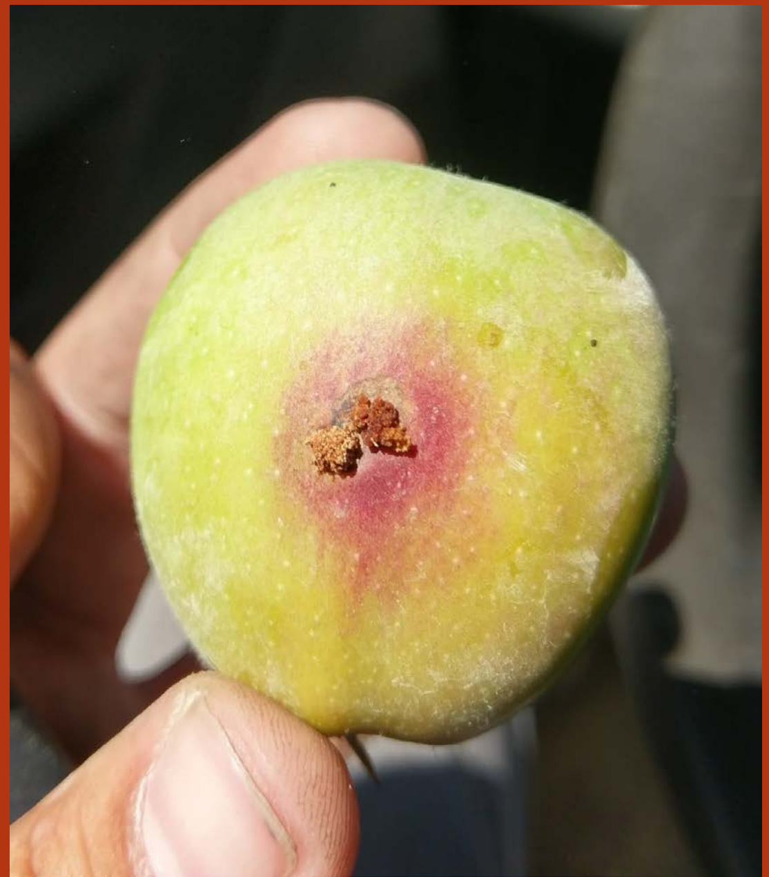
Fig. 5: Codling Moth Damage

This experience has given me the opportunity to network with company leaders that have been working for many years. It was exciting working with them and seeing how much of an impact they make with the growers. I am also grateful that I could meet growers. One day, it could potentially lead to another internship for the grower specifically. From this summer, I have learned what to look for out in the field but also, meeting people is what opens other possibilities and adventures.