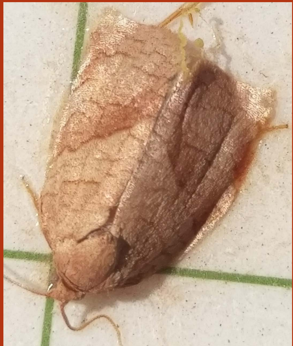
Fig. 2: Oblique Banded Leaf-Roller