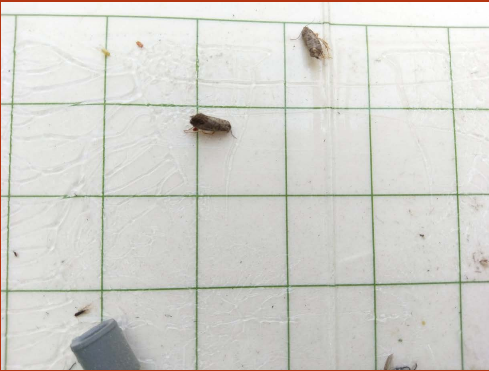
Fig.9: Two Codling Moths trapped in the liner