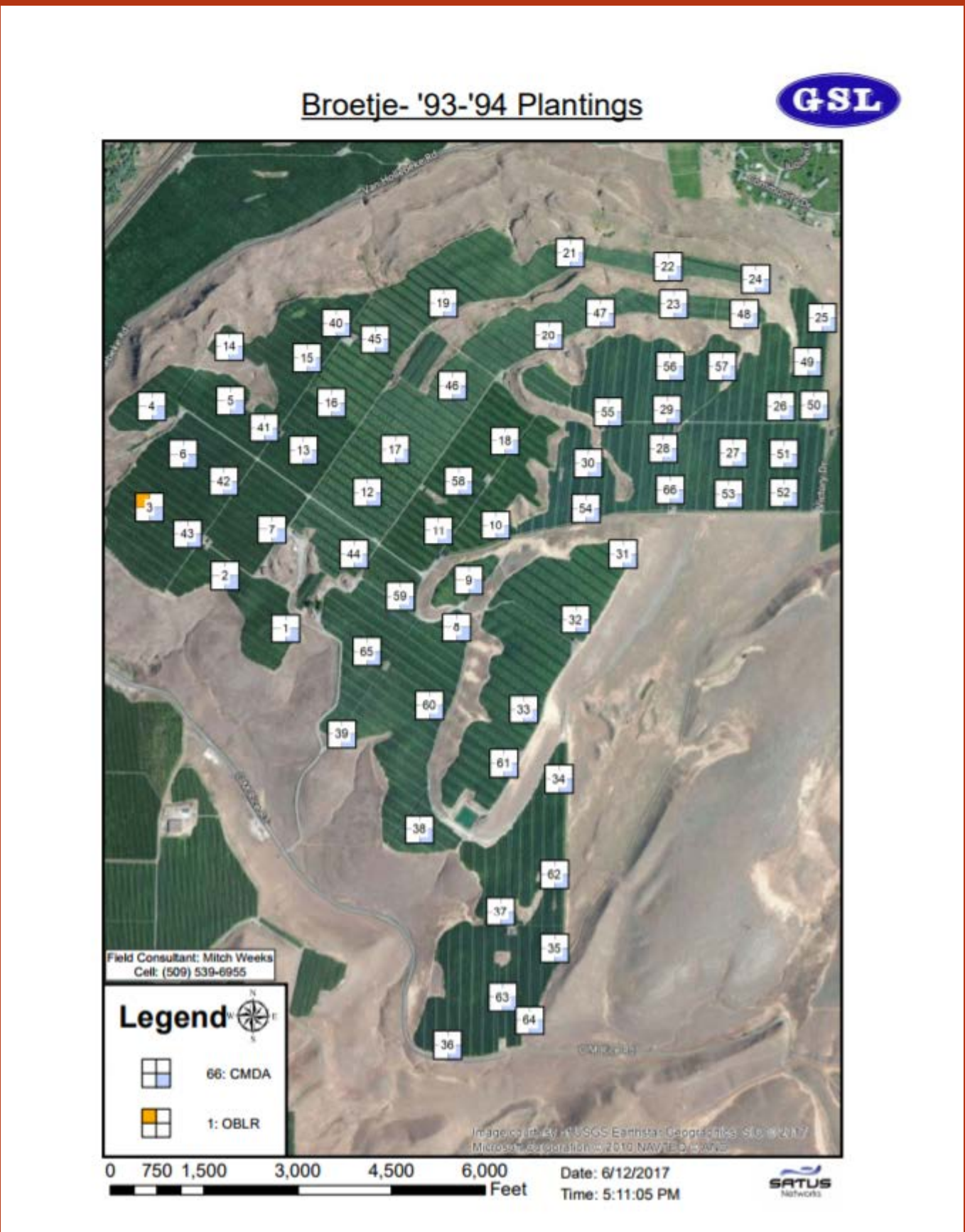
Fig. 7: Example of what one type of mapping option GS Long provides the grower. All the numbers are Trap Locations and some have more than one.