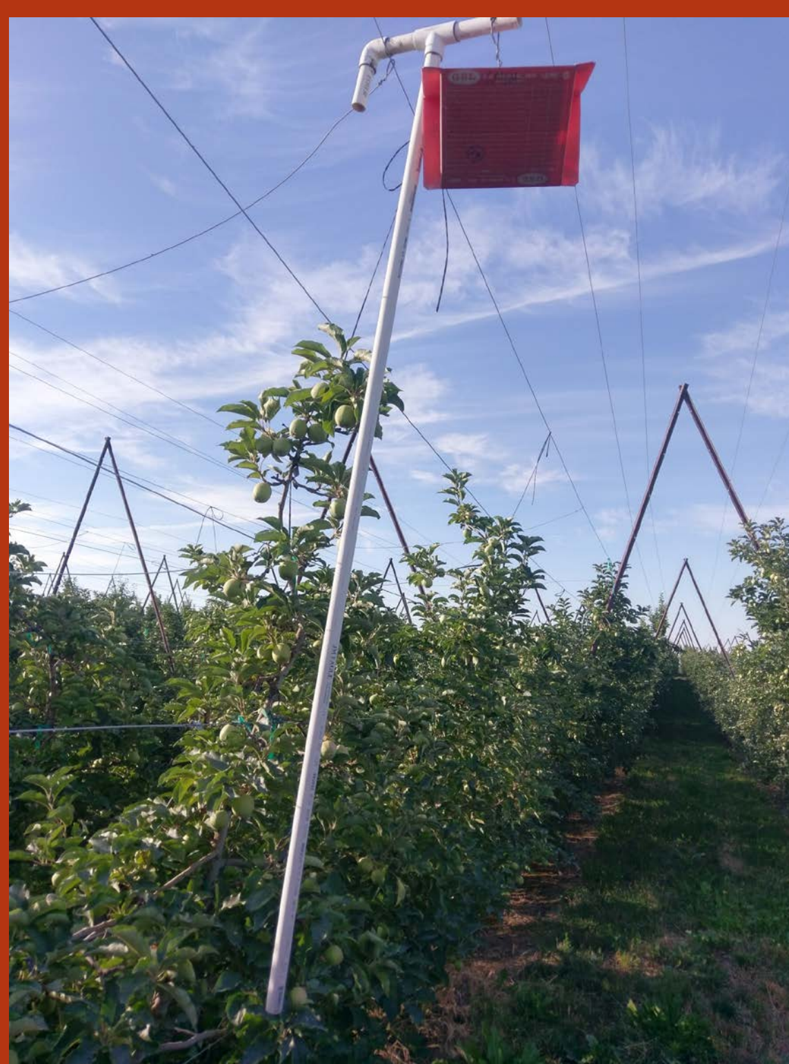
Fig. 4: Example of a trap that is checked daily

G.S. Long Co. provides consultations and works closely with growers providing a variety of resources to help grow top quality fruit. Resources include Map design, Spray Recommendations, Chemical Delivery, and Soil/Plant Nutrition.