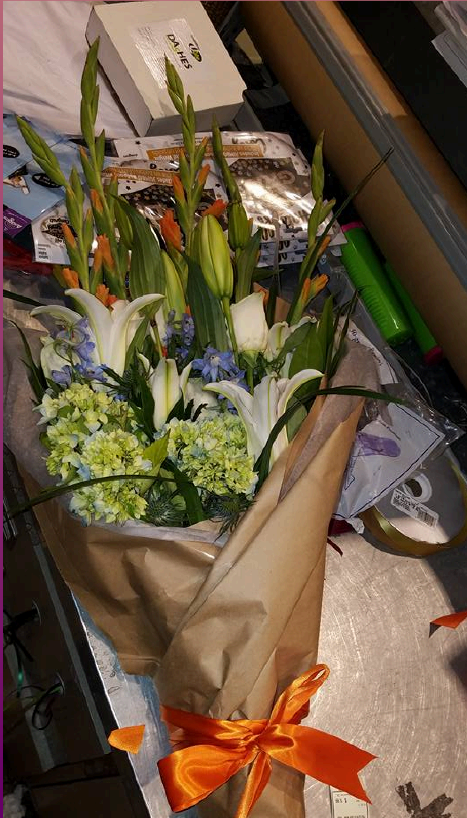
A Custom wrap with blue and orange as the focus as they were the client's favorite colors to be presented to her for her doctorate. Lush with lilies, hydrangea, gladiola, delphinium, and roses.