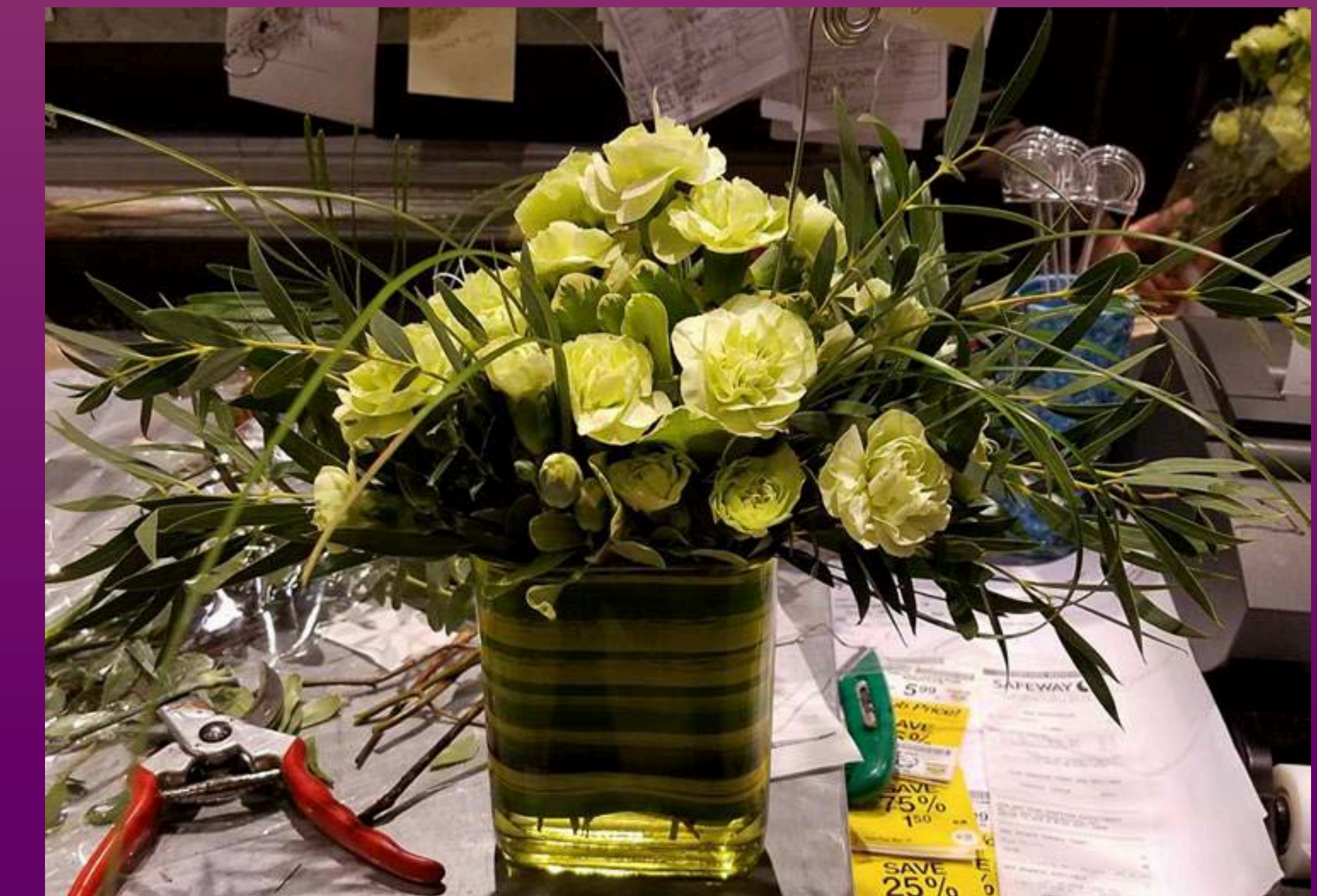
Vert de fleur, a monochromatic green themed petite arrangement a customer needed several of to thank the film staff for a movie filmed here in Pullman early this year.

As the second and only person in the department there are many responsibilities to keep the department in tip-top shape, the following duties are often shared between myself and my supervisor based on schedules and immediacy. We begin with processing anywhere from 10 to 60 boxes of freight, flowers require removal from all protective layers, a fresh cut, and to be displayed. We also process many potted plants which is a similar process but also we will decorate them by adding wrapping, pots, and whatever will spruce up the plant for any occasion. It goes without saying I also do a fair bit of customer service and help many with customer floral work, check-out service, and help with botanical problems and or questions. We make just about any floral design when necessary from weddings, funerals, prom, pageants which lead us to make corsages, boutonnieres, and recently with graduation we even made our own leis after suppliers failed to provide us with enough for how many requests we had. Aside from that I am held to the policies and procedures of any Safeway employee.