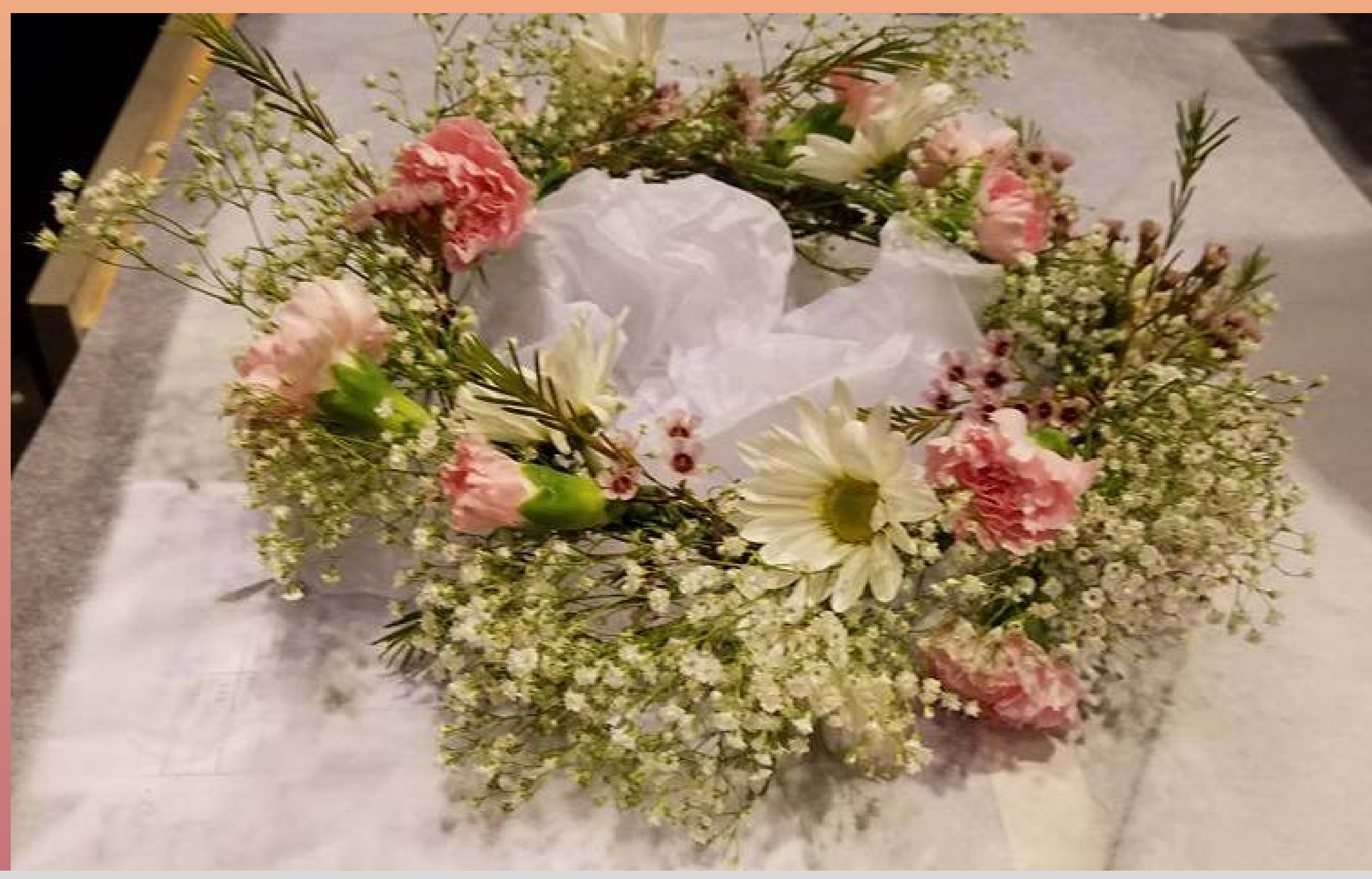
A floral crown requested for a new mother of her first child bought by her loving brother.