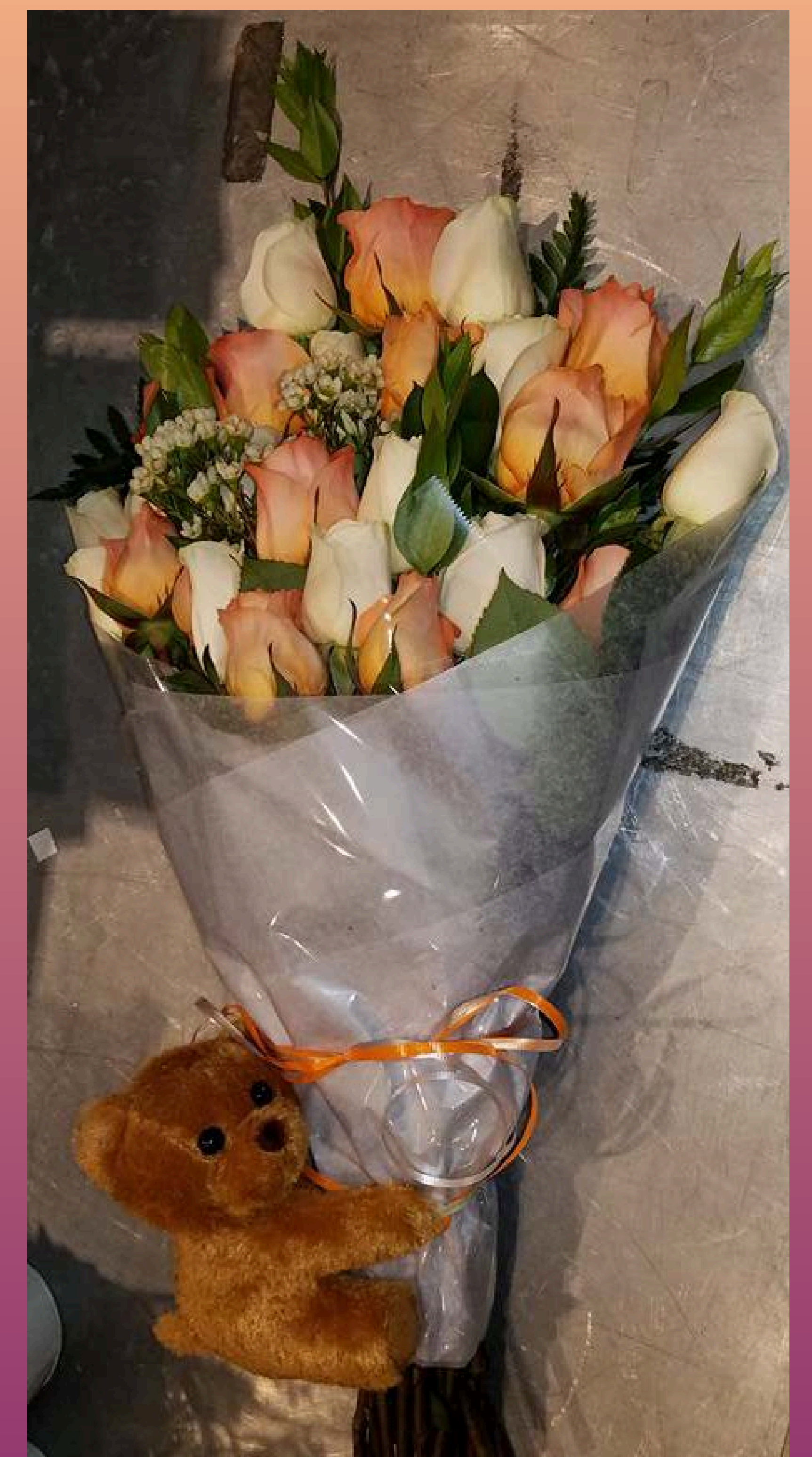
Custom wrap of premium Ecuadorian roses plus additional greens and filler and made use of an elasticated bear that was with a vase that broke.

I am absorbing as much information as I can about the nature of the floral department so I can ride this train as long as possible. I already have the makings to run a small department, so I am going to keep growing as a clerk so that when the time comes I can ascend to a management position with success. One of my goals at this point is to travel and with a corporation like Safeway I can apply for floral manager positions throughout the US because of the many companies all under the same Safeway umbrella. Working with people has reminded me what I enjoyed so much about the service industry, and how my work can impact people's lives. I really enjoy my job and I can see myself here for years and taking on more and more responsibilities. While I finish my schooling this position works so well to keep me happy in this place away from my home, while keeping me in my industry and around what I am truly passionate about which are the plants.