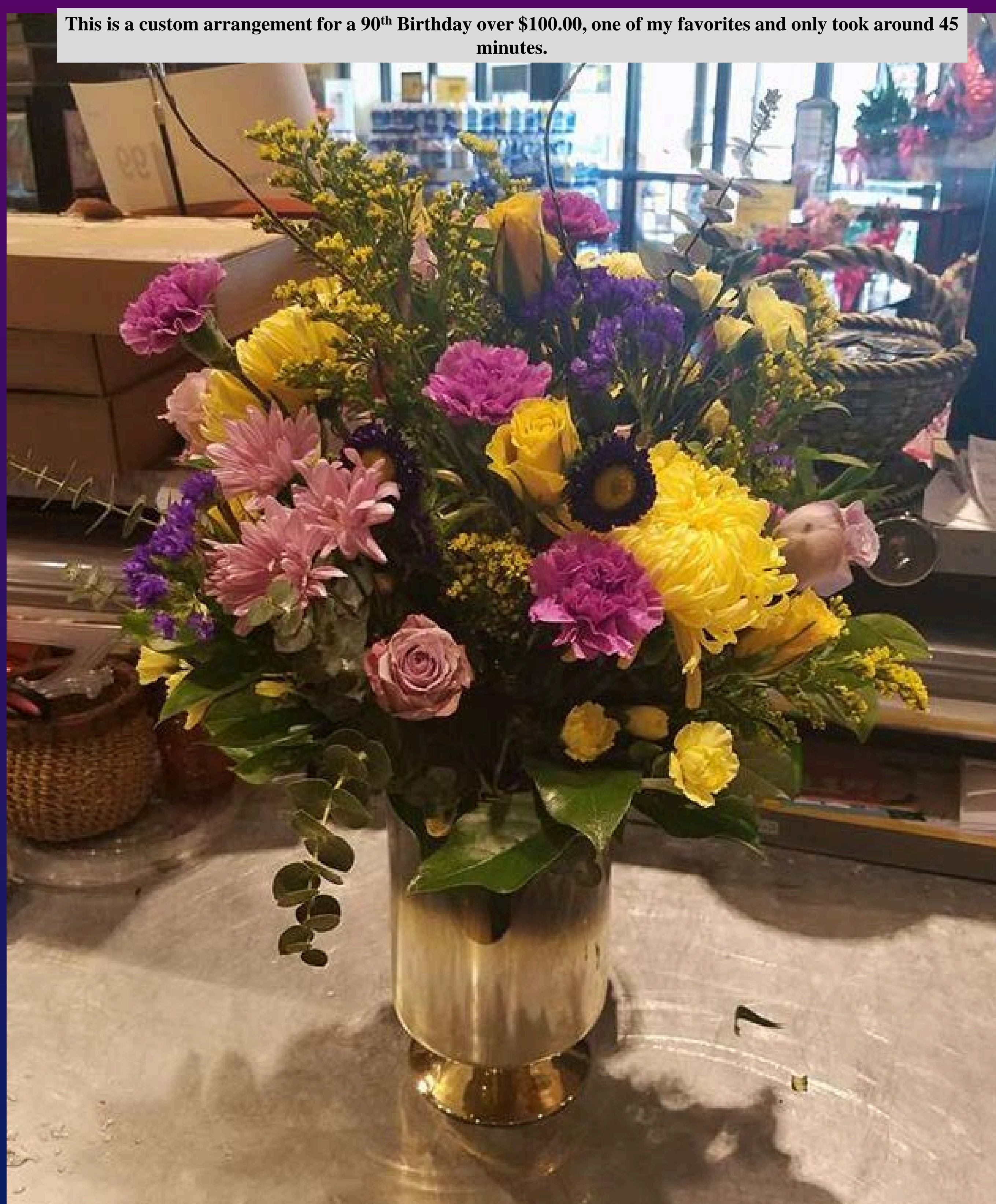
This is a custom arrangement for a 90th Birthday over $100.00, one of my favorites and only took around 45 minutes.